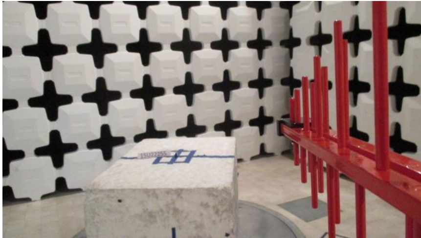
RADIATED BACK PHOTO (BELOW 1 GHz)