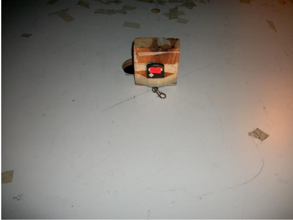
Figure 3.3 Radiated Test Setup, position 3-Z