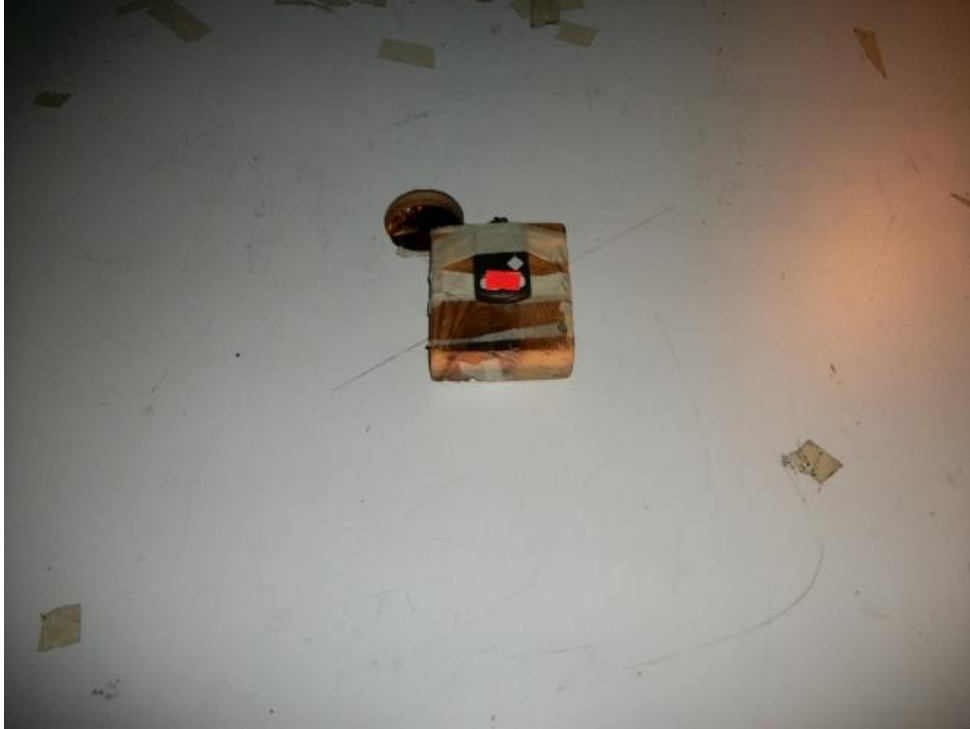
Figure 3.1 Radiated Test Setup, position 1-X