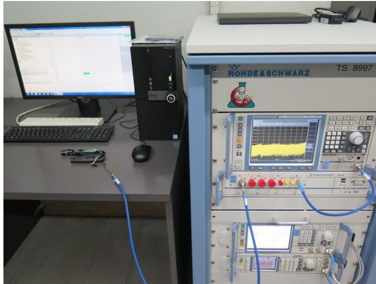
Conducted test (R&S TS8997)