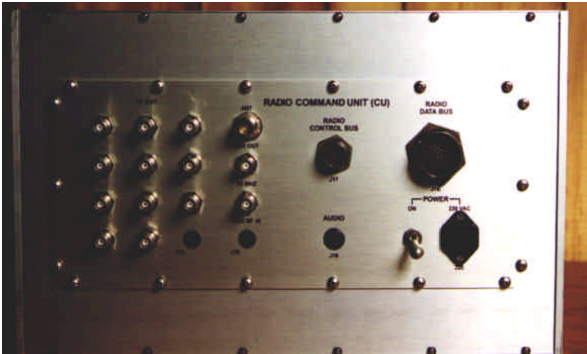
FCC ID CU8 BOX – Base Station Base Station Transmitter – Rear View (Command Unit)