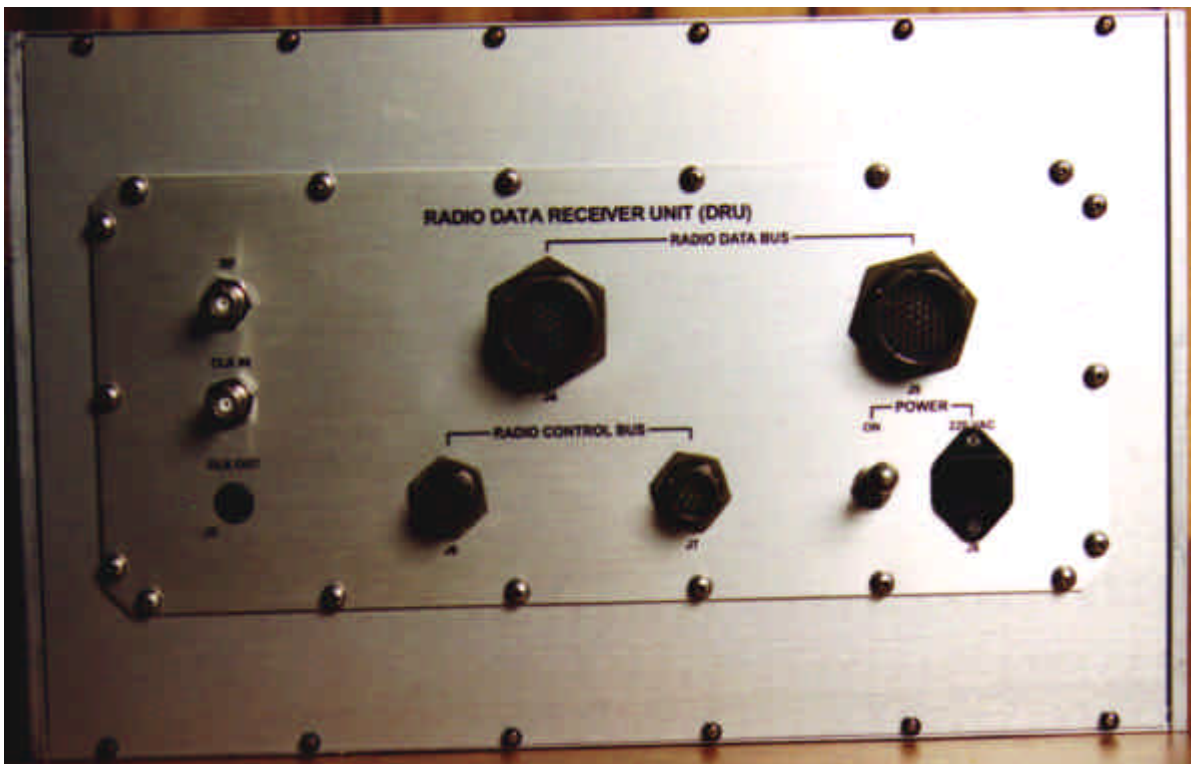
FCC ID CU8 BOX – Base Station Base Station Transmitter – Rear View (Receiver Unit)