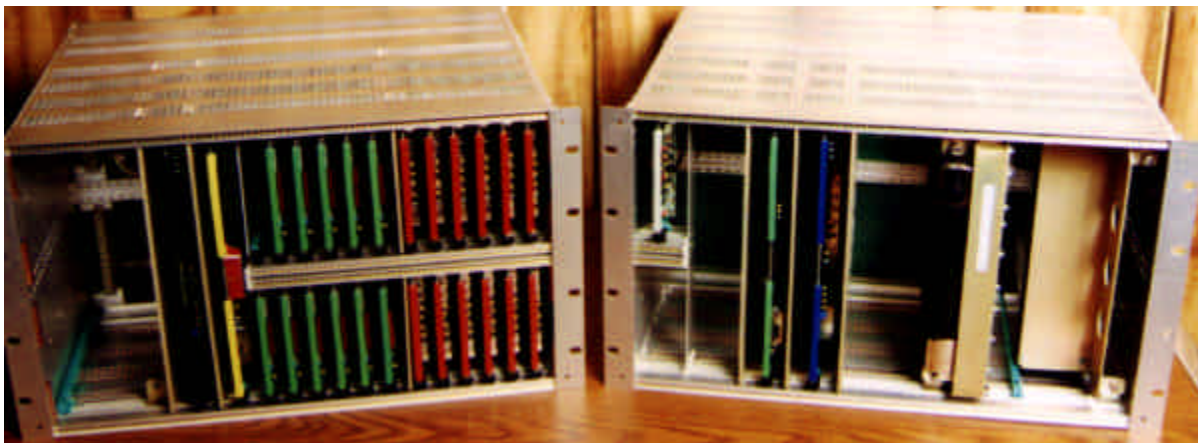
FCC ID CU8 BOX – Base Station Base Station Transmitter – Front Panels Removed