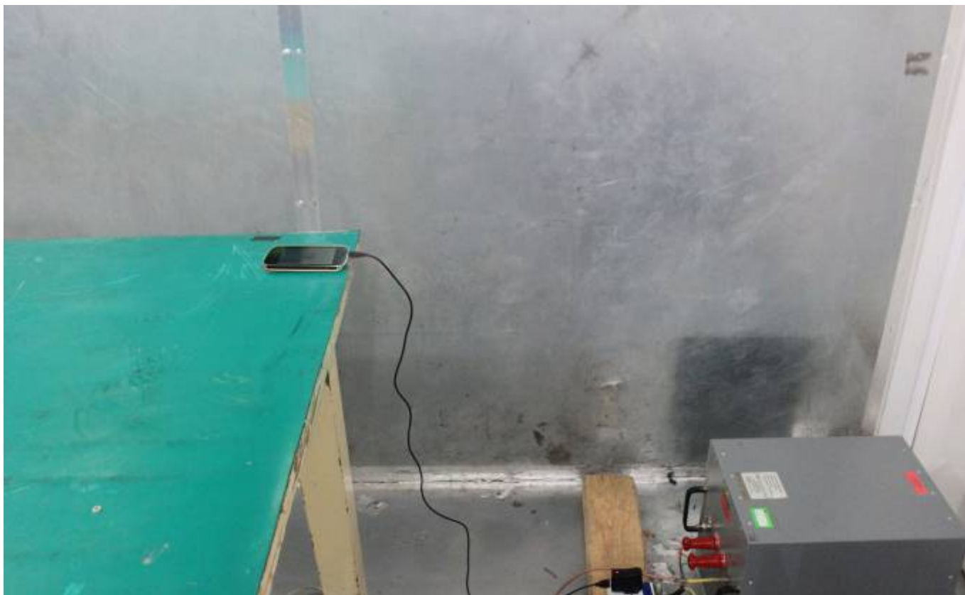
BT CONNECTED TO THE SPECTRUM ANALYZER