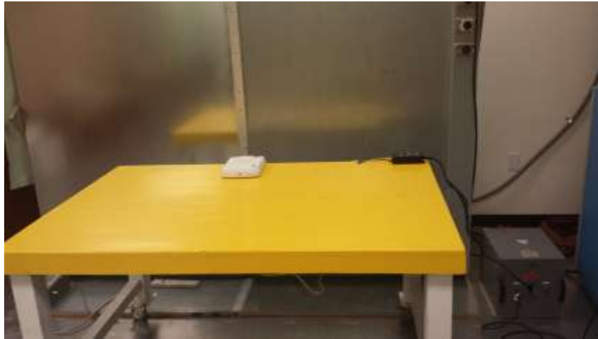
LINE CONDUCTED EMISSION (BACK)