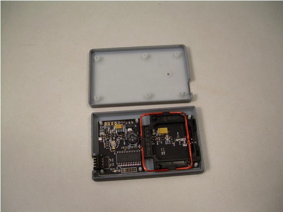
View of the EUT with the Housing Opened