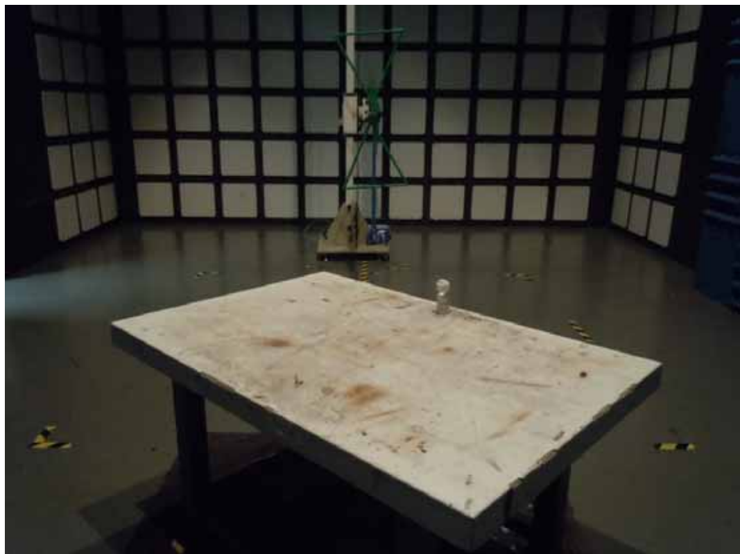
SETUP WITH MAXIMUM DETECTED EMISSION AT VERTICAL POLARIZATION (M/N: T2 HALF SPIRAL CFL – 13W)