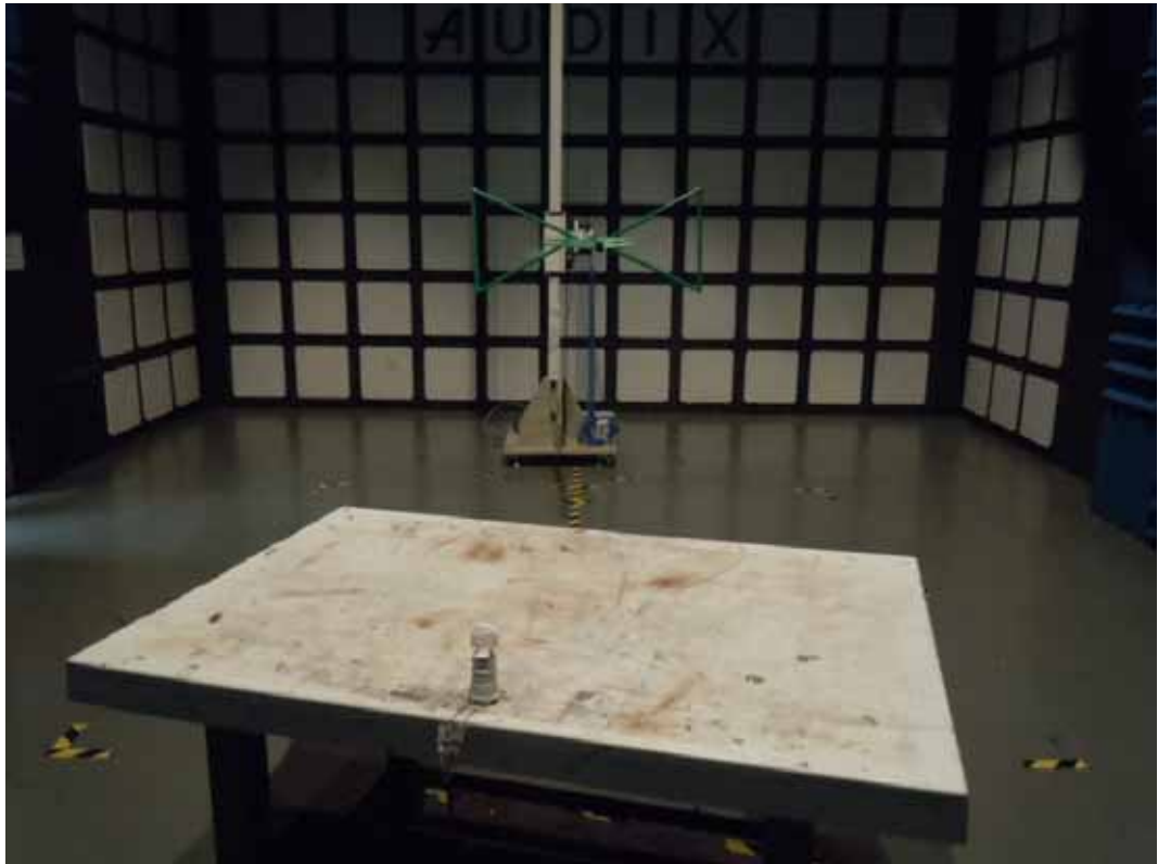
SETUP WITH MAXIMUM DETECTED EMISSION AT HORIZONTAL POLARIZATION (M/N: T2 HALF SPIRAL CFL – 13W)