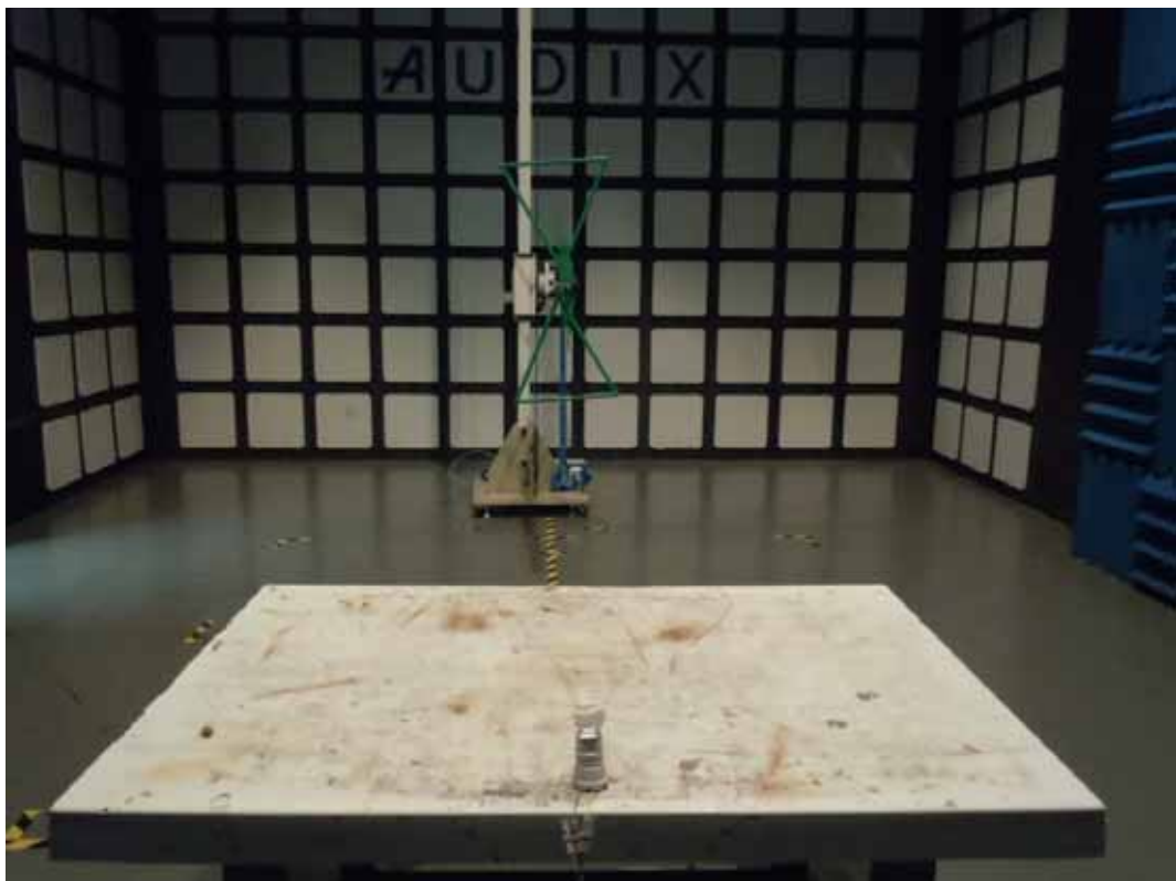
BACK VIEW OF RADIATED EMISSION TEST