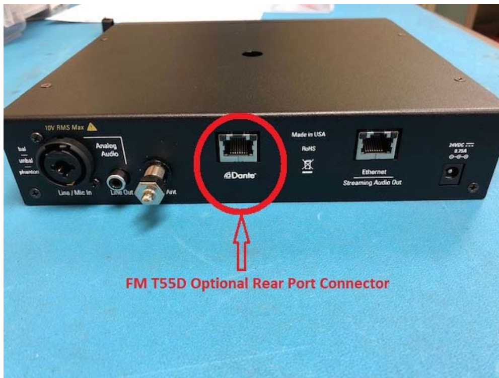
Model Option: FM T55D, Back of unit, showing additional Dante Port.

The optional Model FM T55D appears nearly identical to the FM T55 in external views, with the exception of an additional rear port for the Dante audio input connection, shown in the red circle in photo below, and the FCC/ISED label on the bottom containing the indicated model option for that unit which is shown in the next photo.