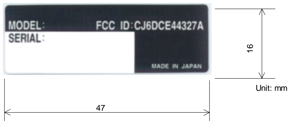
FCC ID Nameplate

A Nameplate of this type or one similar to this will be affixed to every Transceiver.