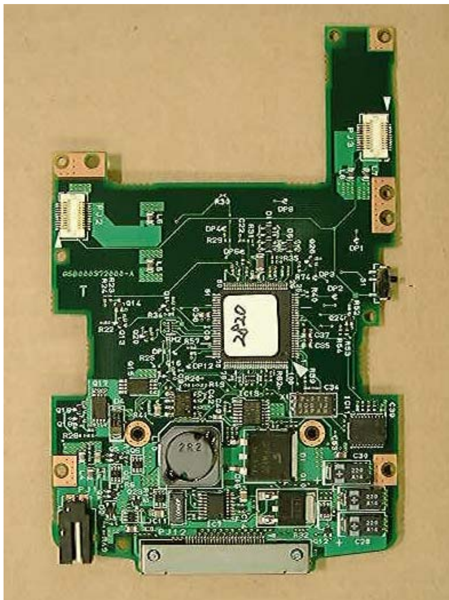
Circuit Board (Back)