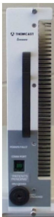
Figure 10: Power amplifier segment front panel.