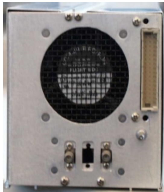
Figure 9: Upconverter module rear panel.