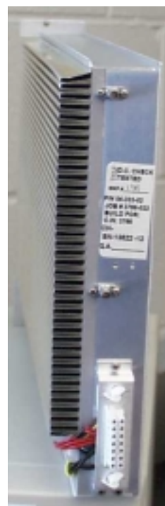
Figure 11: Power amplifier segment rear panel.