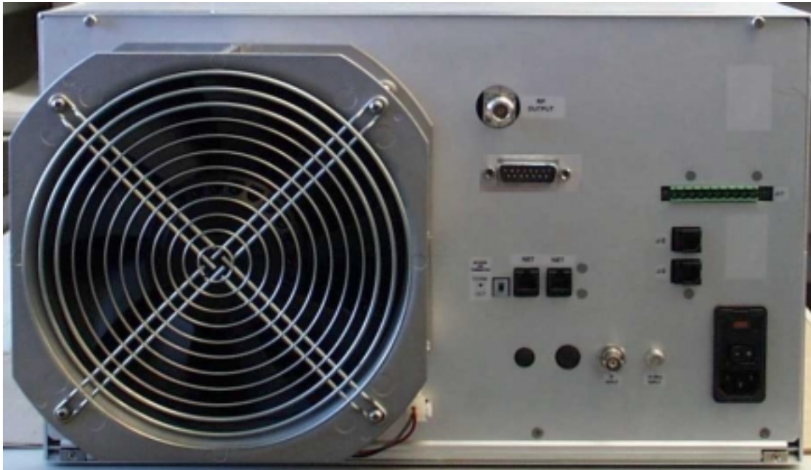
Figure 2: Sub-chassis rear panel.