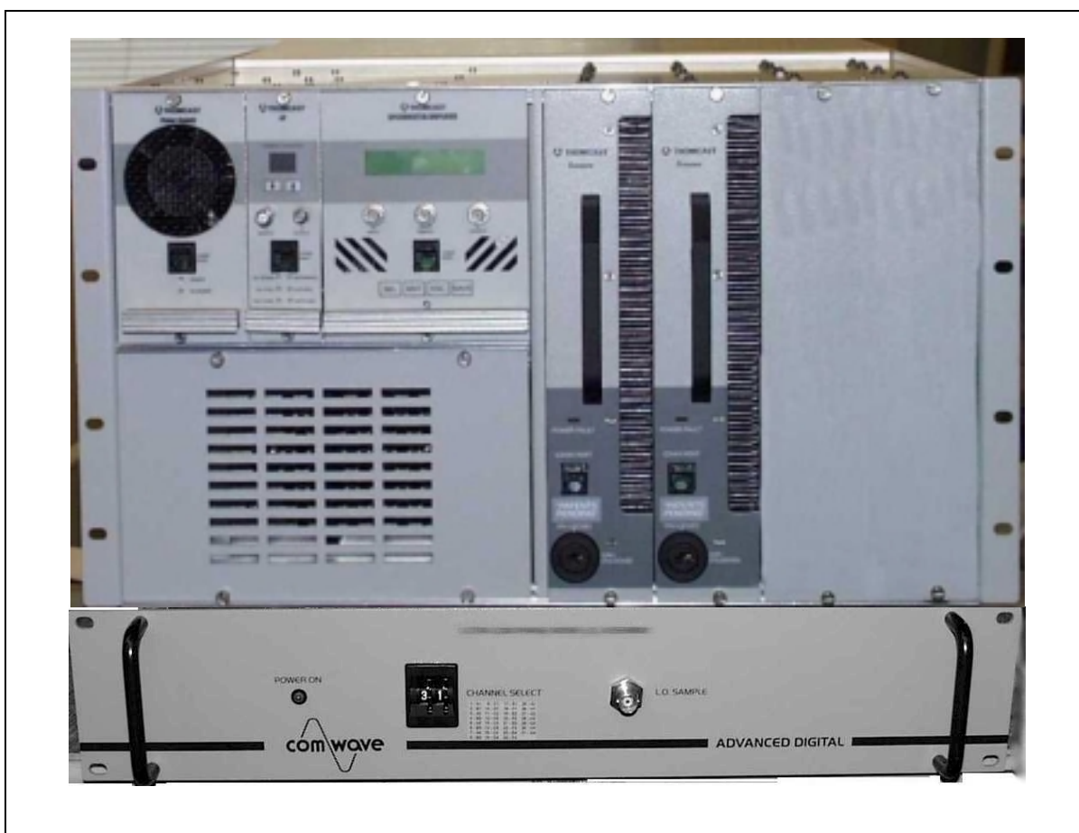
Figure 1: SDA2500C transmitting system (SD2500C with Agile Synthesizer Drawer).