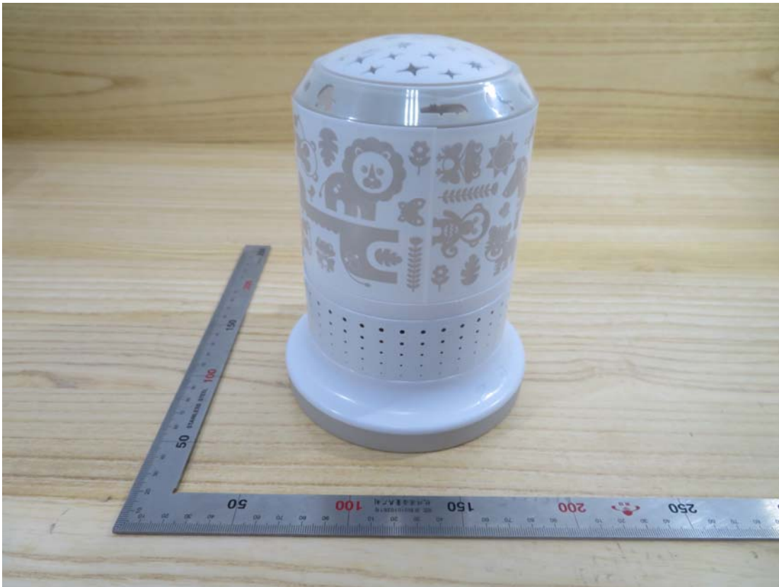
Left View of EUT