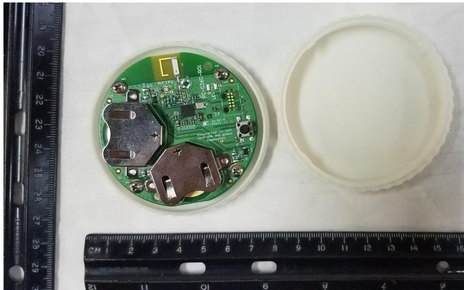
Figure 1. Enclosure Opened