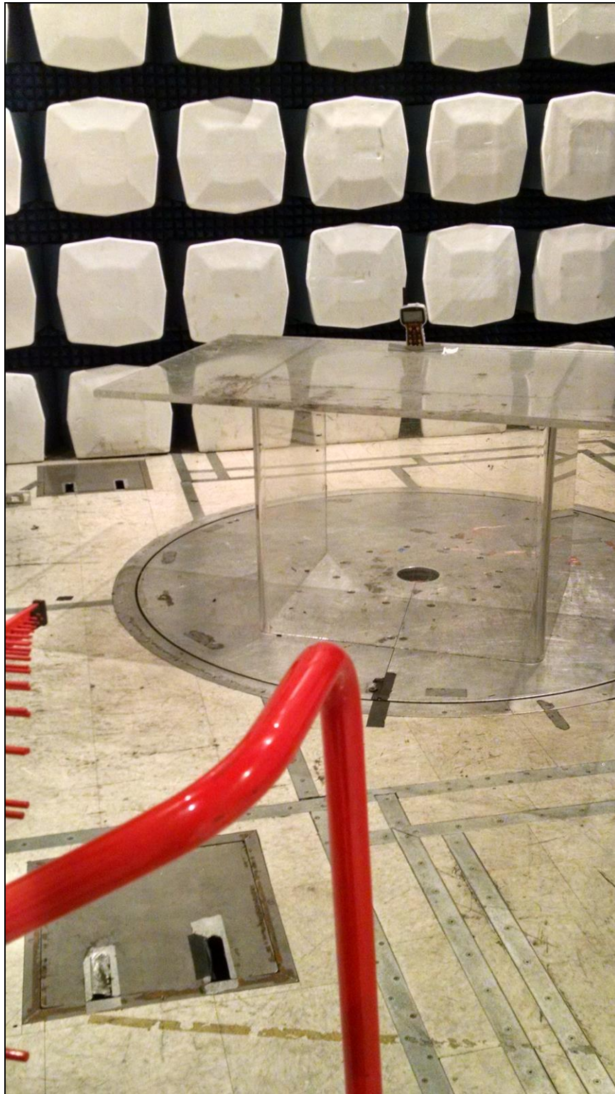
Photograph 1. Radiated Emissions, Test Setup