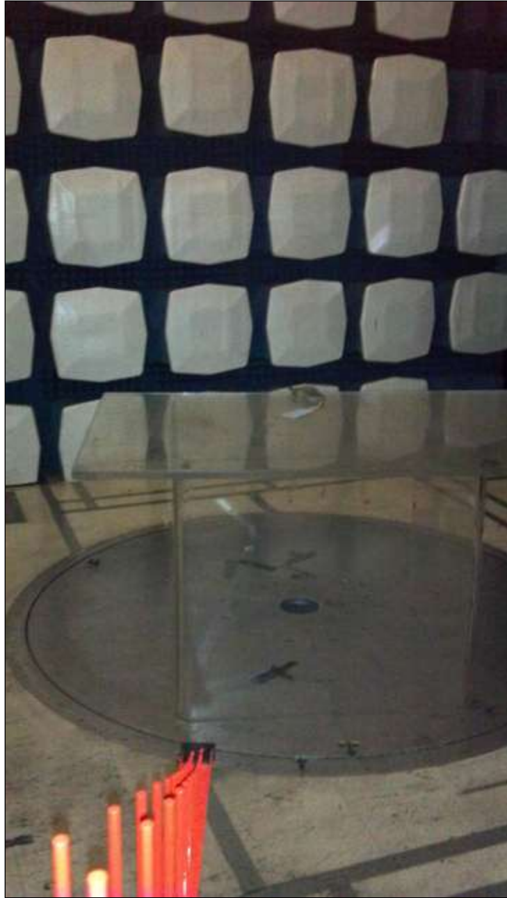
Photograph 1. Radiated Emission, Test Setup