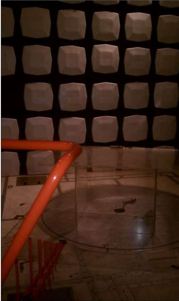
Photograph 2. Radiated Spurious Emissions, Test Setup, LF