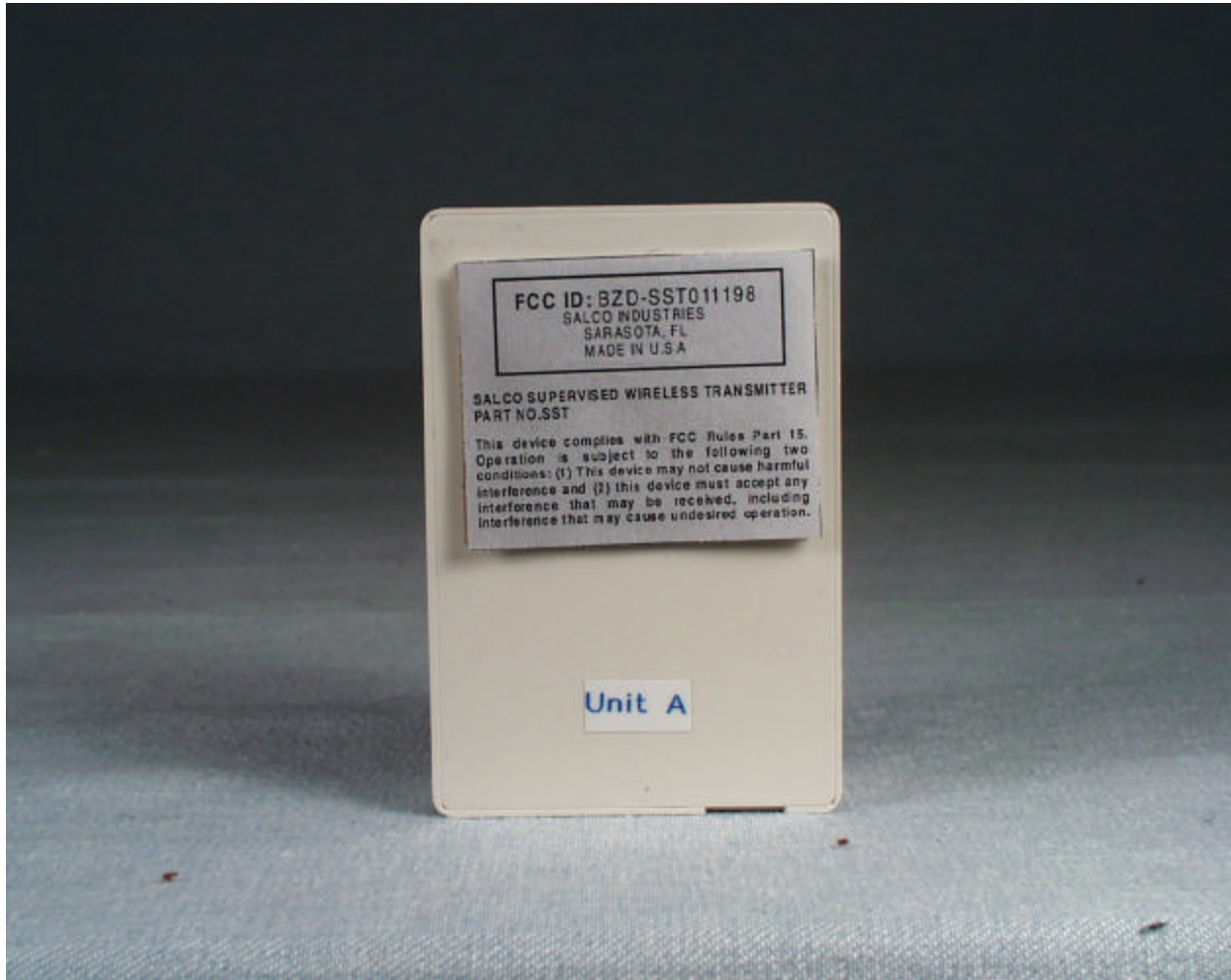
Photograph showing label placement