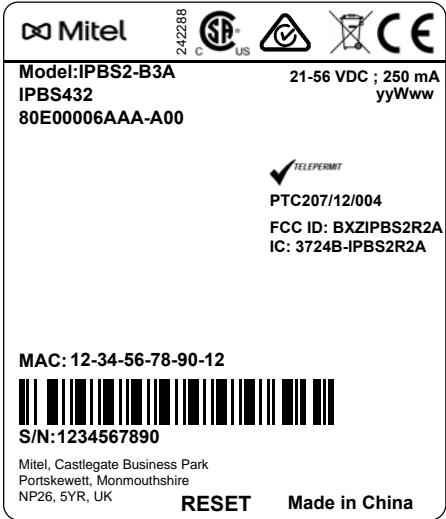
Label type: IPBS2 Product label Total size: 58.6*68.4 mm