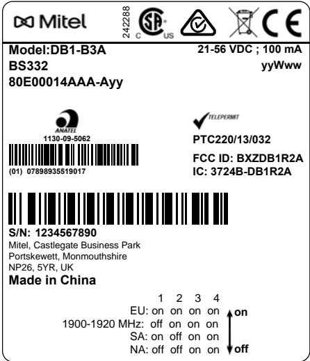
Label type: DB1 Product label Total size: 58.6*68.4 mm