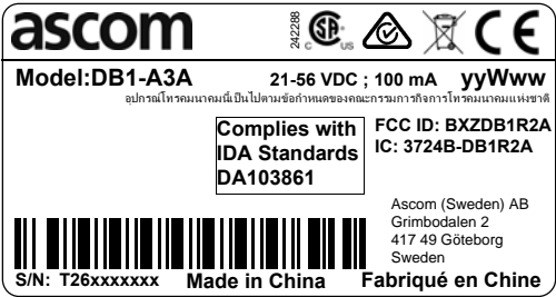
Label type: DB1 Box label Total size: 66*35 mm