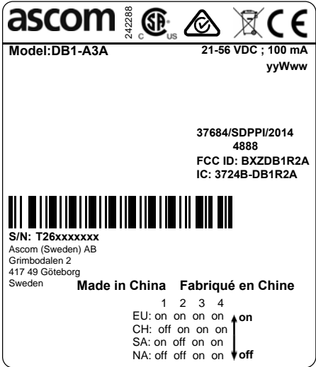
Label type: DB1 Product label Total size: 58.6*68.4 mm