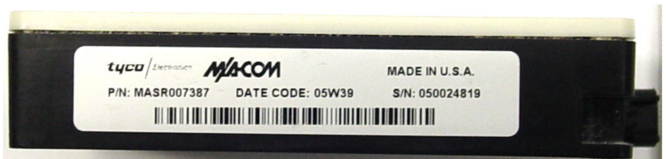
Photograph 4: Top View of the EUT with Labelling