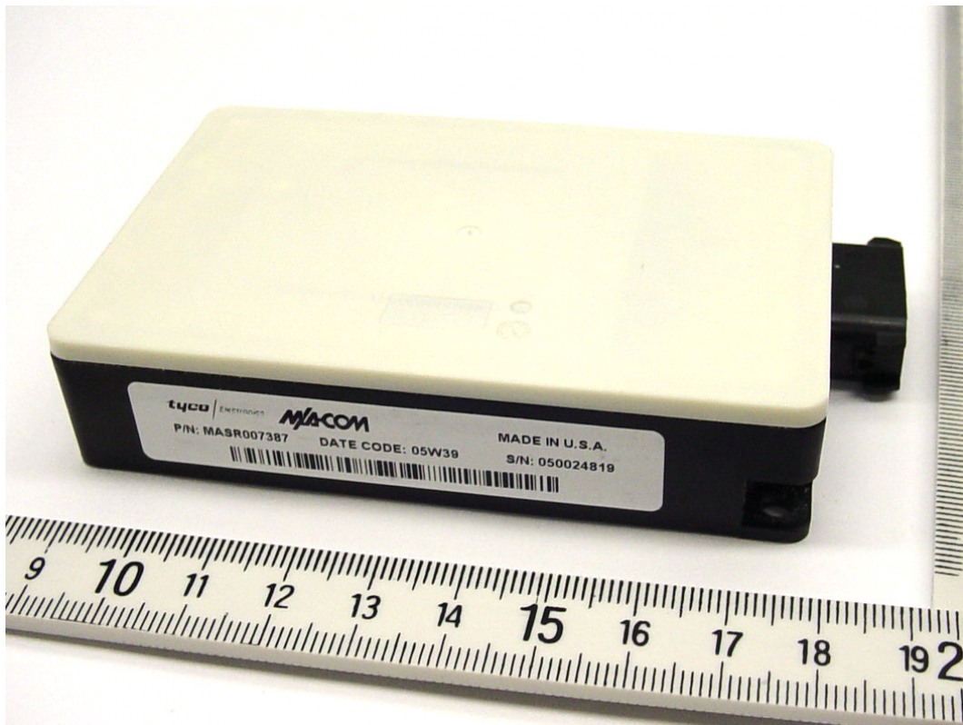
Photograph 3: Front Side / Bottom View (Sensor Radome Face and Labelling) of the EUT