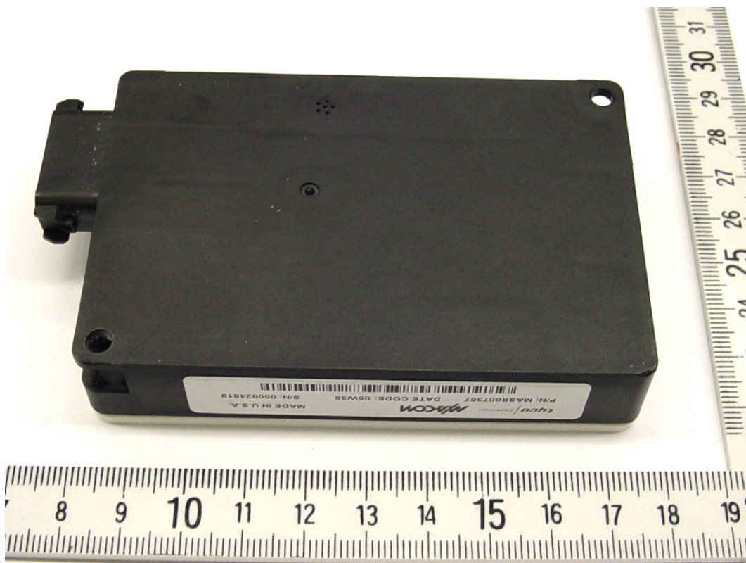
Photograph 5: Rear Side View of the EUT