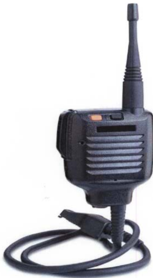
Fig. 7. Microphone with "1/4-wave" Antenna.