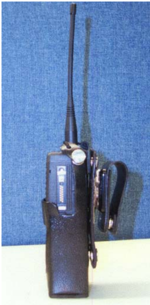
Fig. 4. The M/A-Com Portable Radio P-801T in belt mount holster.