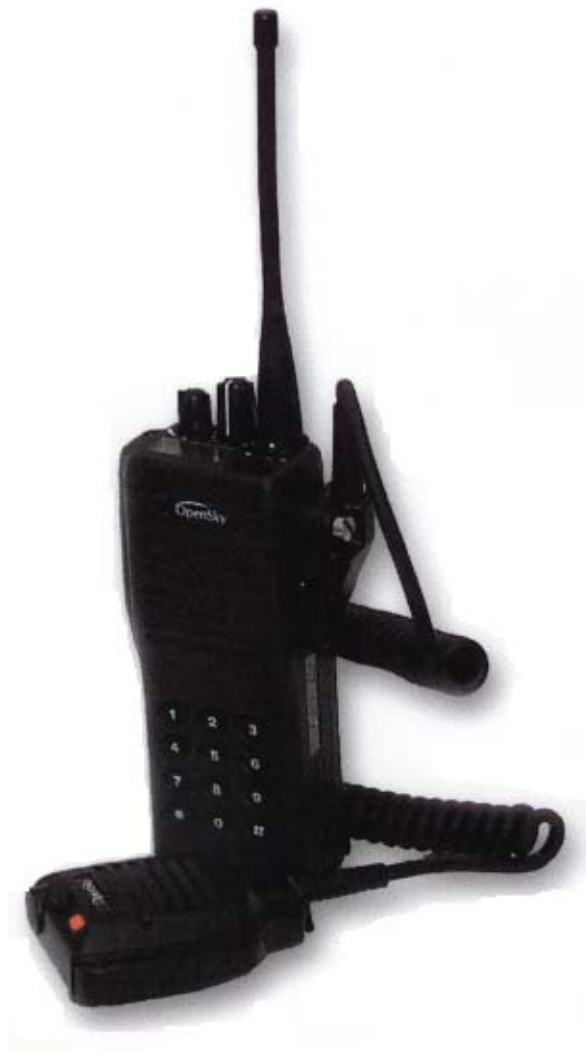
Fig. 1. Photograph of the M/A-Com Model P-801T Two-Way Radio.