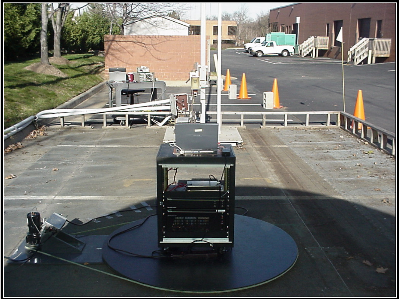
PHOTOGRAPH 1: RADIATED EMISSIONS – FRONT VIEW