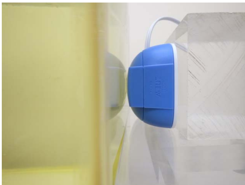
Back surface with 0mm separation