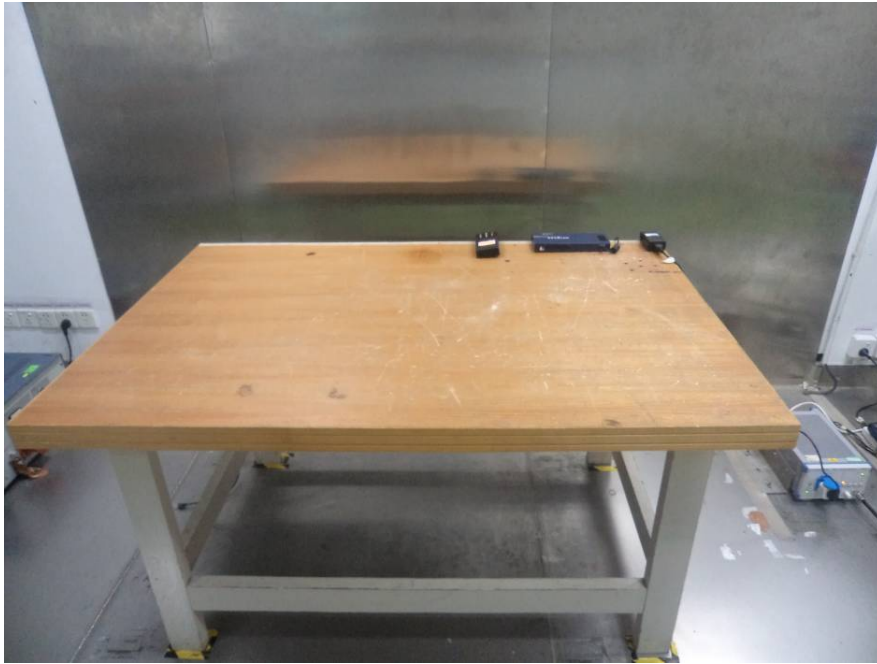
Conducted Emissions - Side View (Powered by PoE)