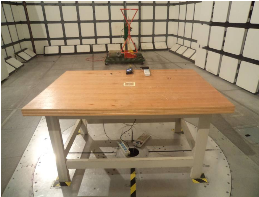
Radiated Emissions – Rear View (30-1000 MHz)