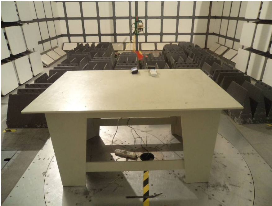
Radiated Emissions – Rear View (1-25 GHz)