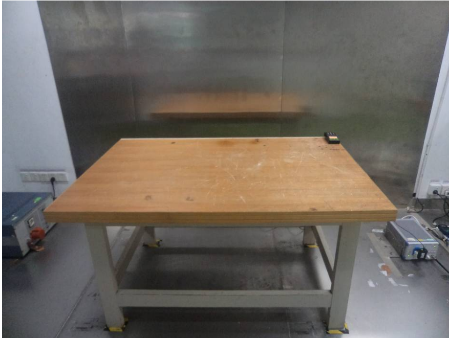
Conducted Emissions - Side View (Powered by Adapter)