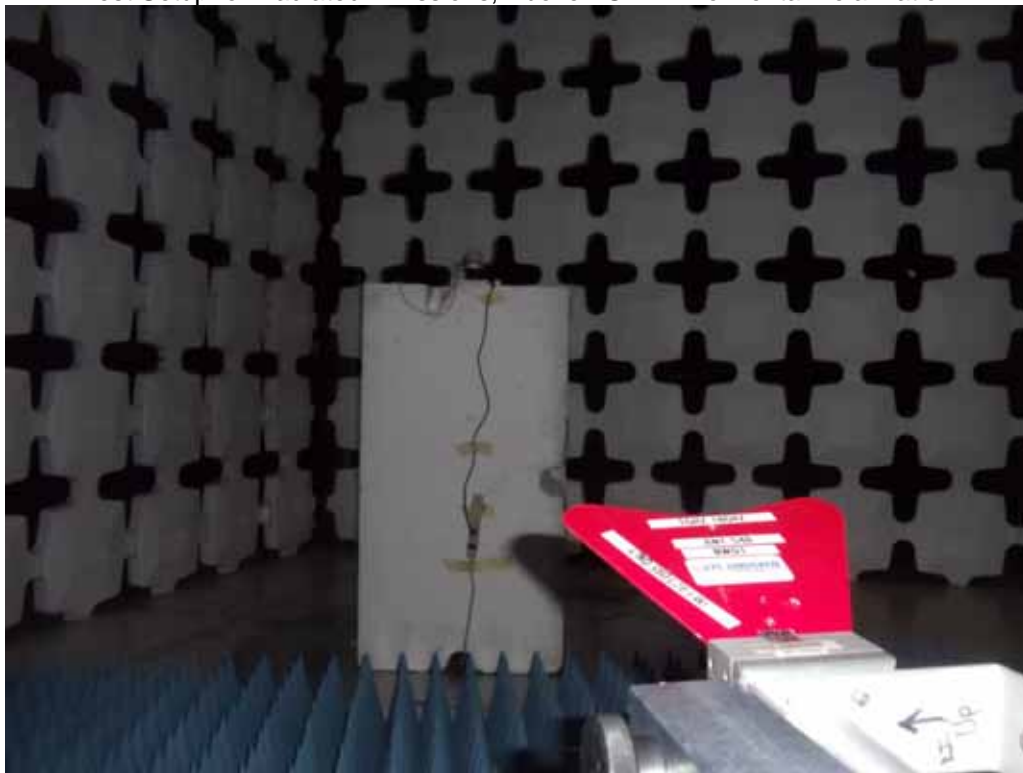
Test Setup for Radiated Emissions, Above 1GHz – Vertical Polarization