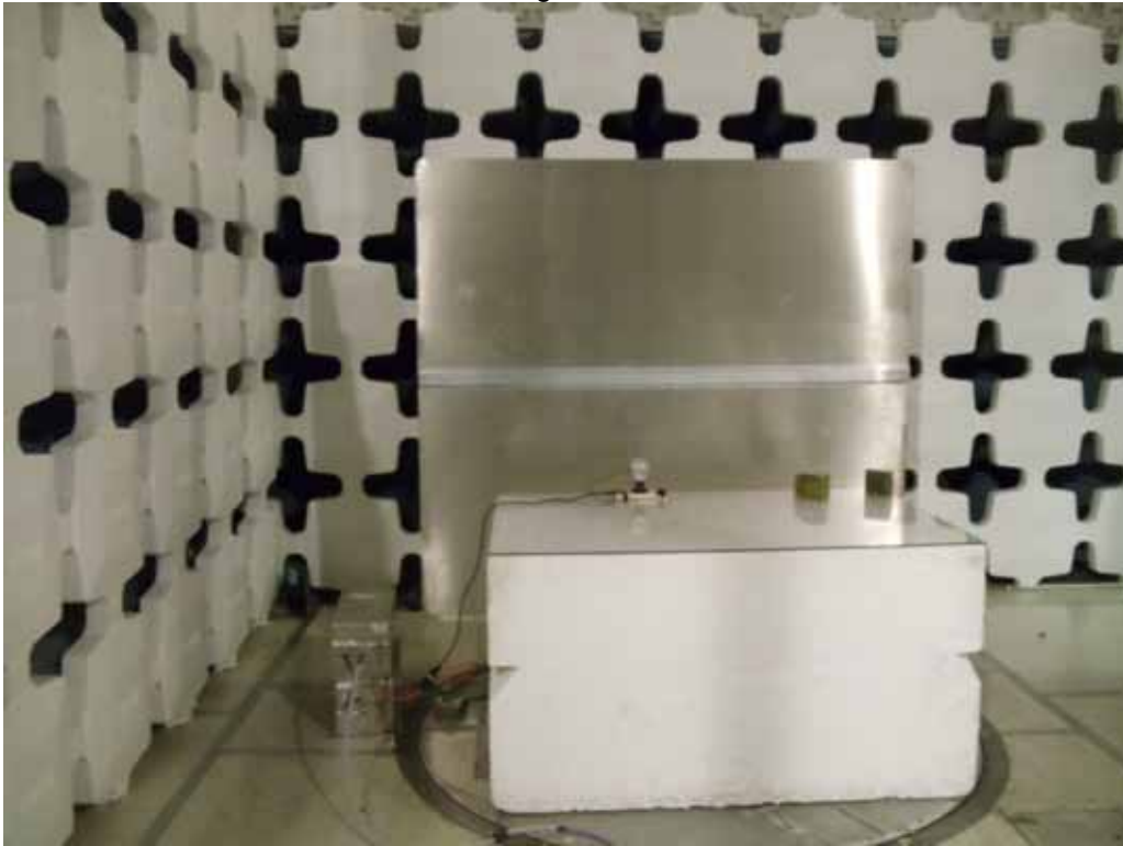
Test Setup for Conducted Emissions