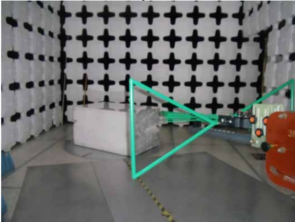
Test Setup for Radiated Emissions, 30MHz to 1GHz – Horizontal Polarization