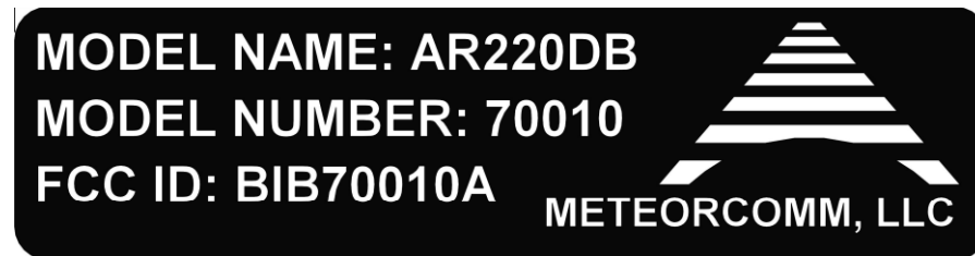
Figure 1 – AR220 DB Model Label Design