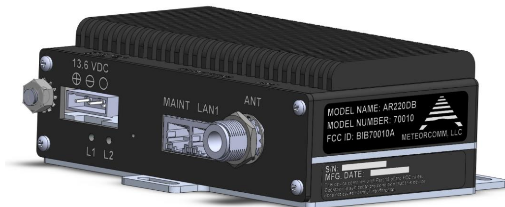
Figure 3 - AR220DB Radio - Label Placement – Perspective view