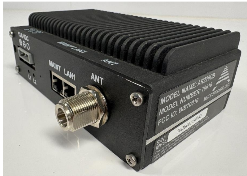
Figure 6 - AR220 DB Radio Label placement - Picture, perspective

Note: The label shown on the picture below shows the location of the label, on a prototype unit. The label text on this picture does not match exactly the actual text on production units. See [Figure 1 – AR220DB Model Label Design] for the actual text.