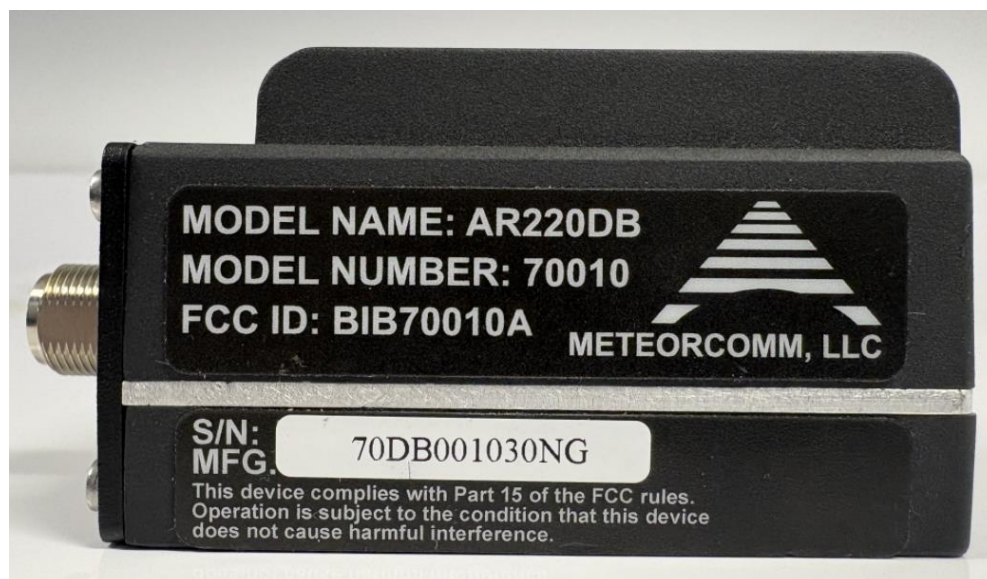
Figure 7 - AR220 DB Radio Label placement - photo - right side