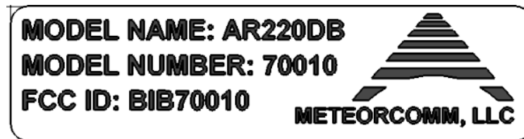
Figure 1 – AR220 DB Model Label Design