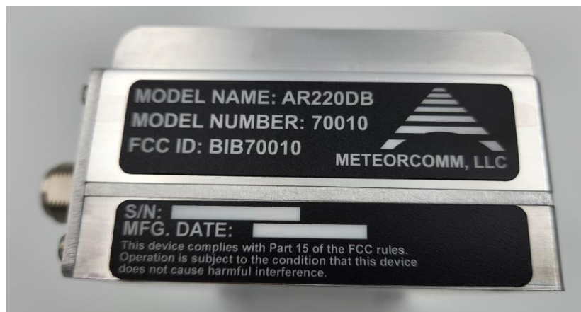
Figure 7 - AR220 DB Radio Label placement - photo - right side