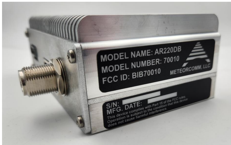
Figure 6 - AR220 DB Radio Label placement - Picture, perspective

Note: The label shown on the picture below shows the location of the label, on a prototype unit. The label text on this picture does not match exactly the actual text on production units. See [Figure 1 – AR220DB Model Label Design] for the actual text.