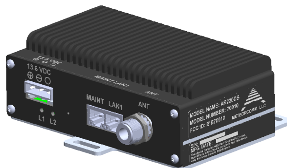
Figure 3 - AR220DB Radio - Label Placement – Perspective view