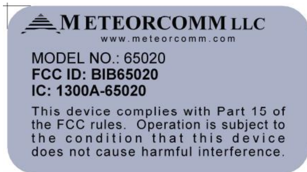
Figure 1 - ITCR NG Loco Radio Label Design