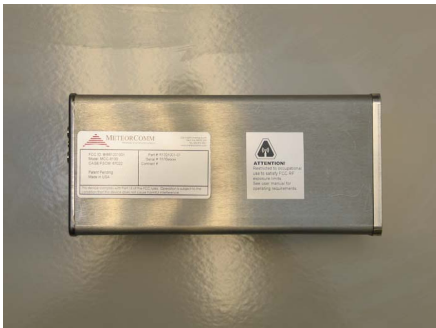
Figure 1.3 FCC and RF Label locations– Radio Unit