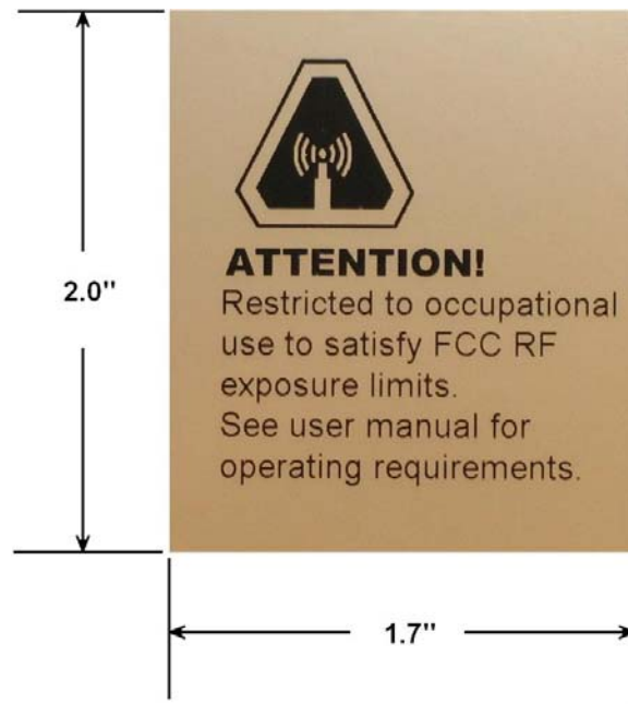
Figure 1.2 RF Exposure Label