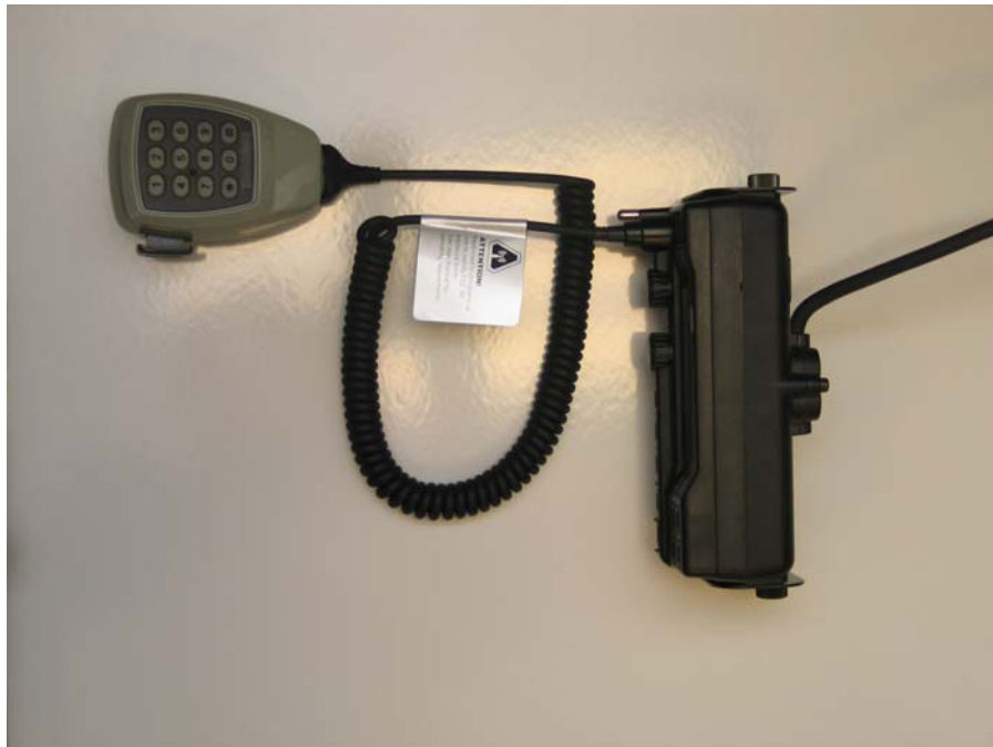
Figure 1. RF Label location – Microphone