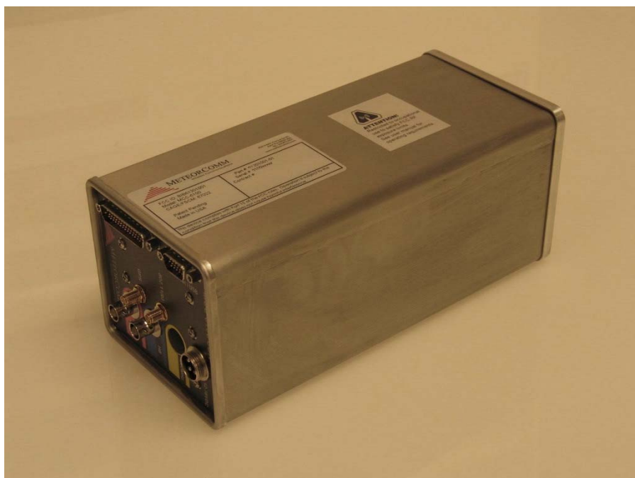
Figure 1.4 FCC and RF Label locations – Radio Unit