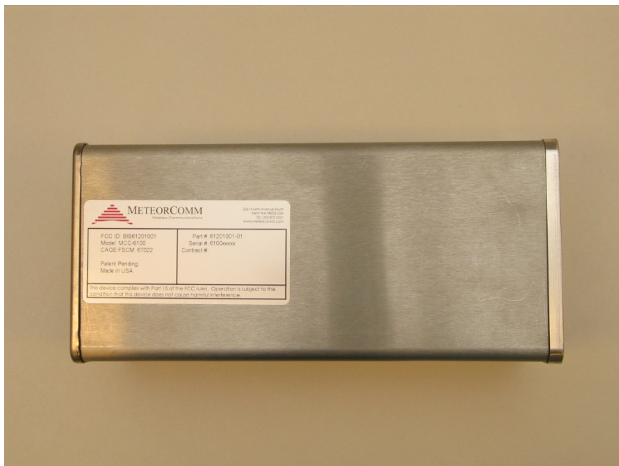
Figure 1.2 FCC Label location