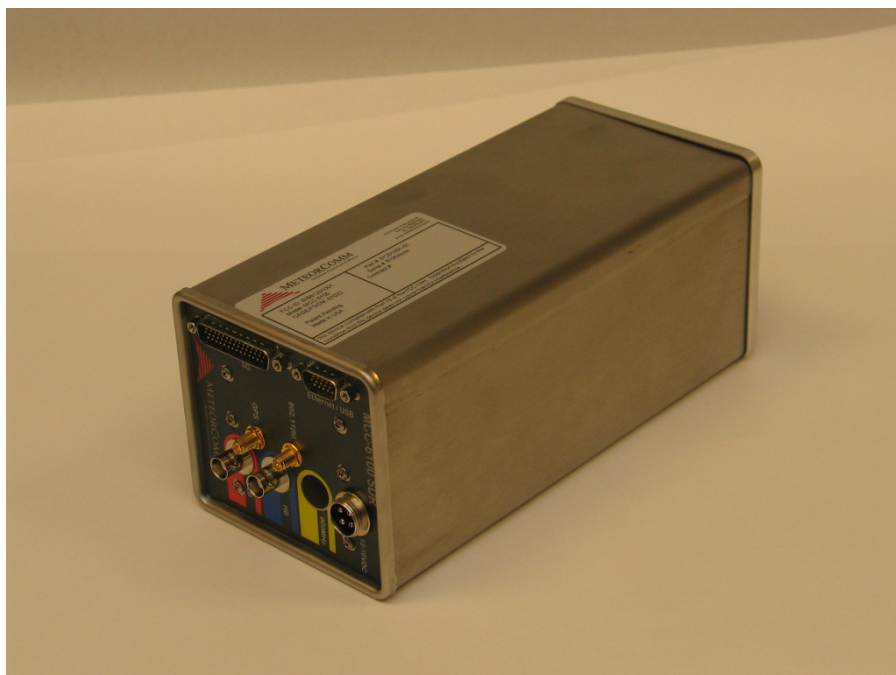
Figure 1.3 FCC Label location