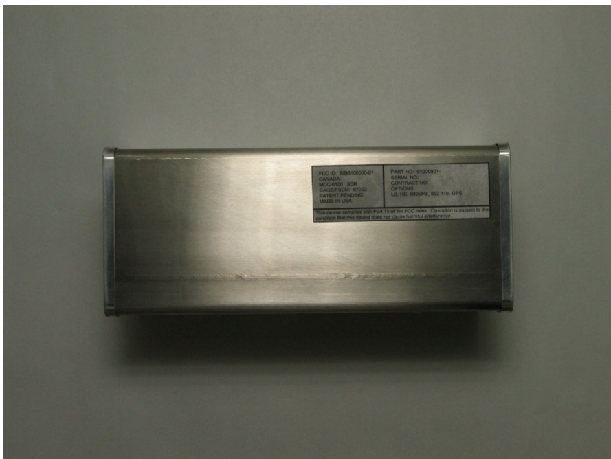
Figure 1.2 FCC Label location