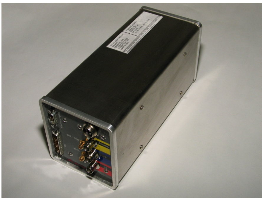
Figure 1.3 FCC Label location