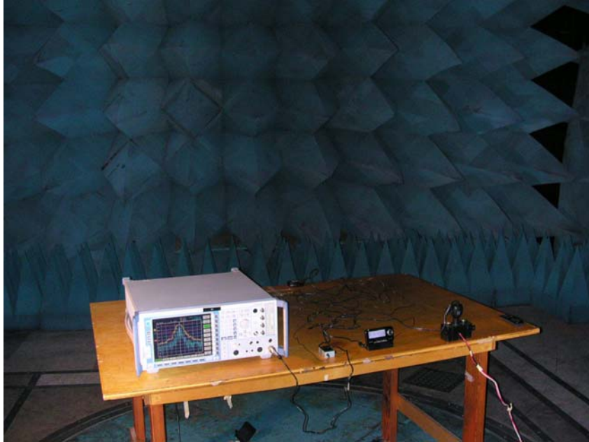
Photograph 16 : Occupied Bandwidth Setup