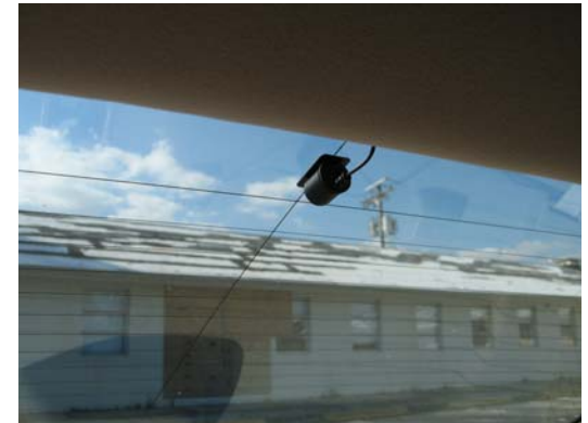
Photograph 12 : Toyota Camry