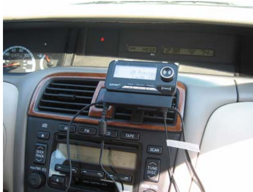
Photograph 11 : Toyota Camry