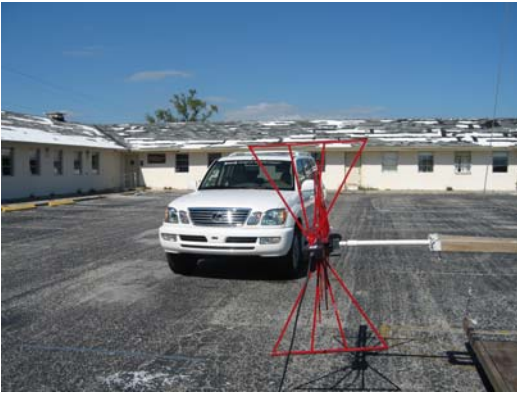
Photograph 7 : Lexus SUV