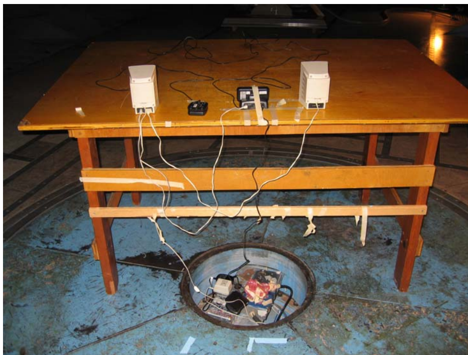
Photograph 3 : Home Cradle Radiated Emissions Setup