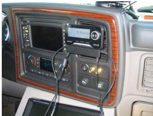
Photograph 14: Cadillac Escalade