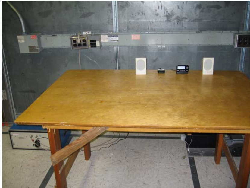
Photograph 1 : Test Setup for Conducted Emissions