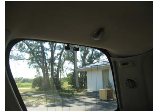
Photograph 15: Cadillac Escalade