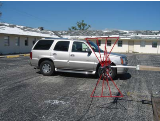
Photograph 13: Cadillac Escalade