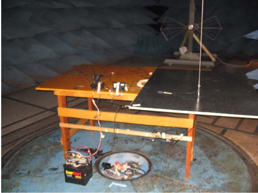
Photograph 6 : Intentional Radiator – FM Aerial Setup