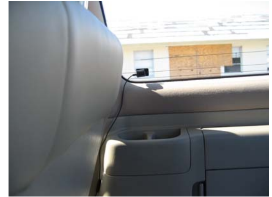
Photograph 9 : Lexus SUV