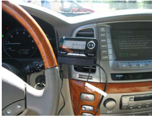
Photograph 8 : Lexus SUV