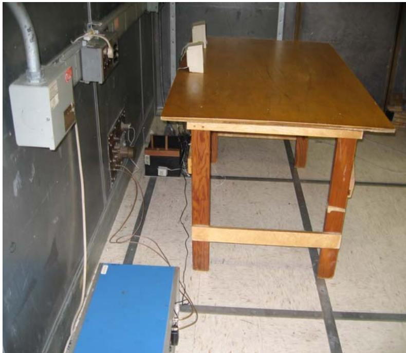
Photo 2 : Test Setup for Conducted Emissions Radiated Emissions – Home Stand