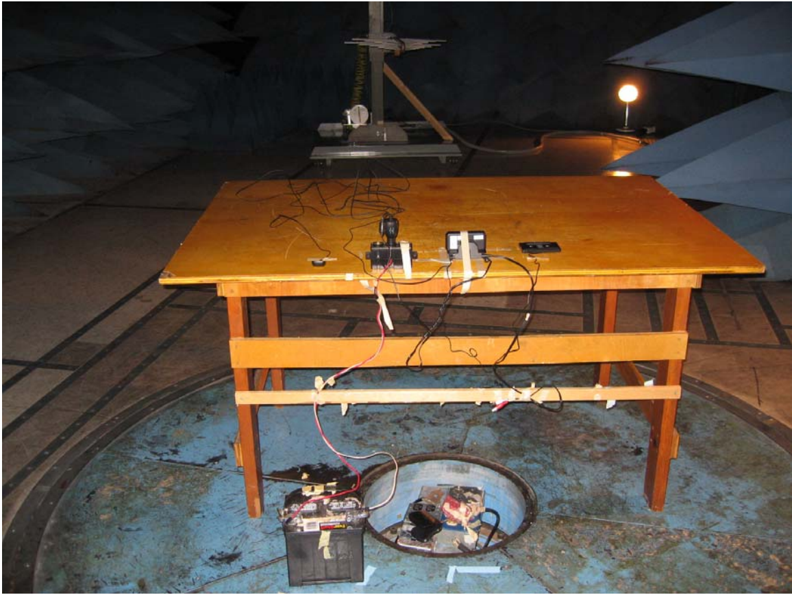
Photograph 5 : XM Antenna with Cassette Adapter – Radiated Emissions Setup