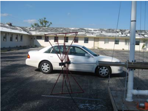
Photograph 10 : Toyota Camry