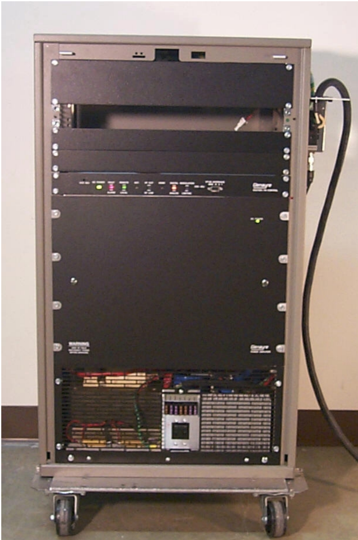
Front view of transmitter, Model: GL-T8600-CN