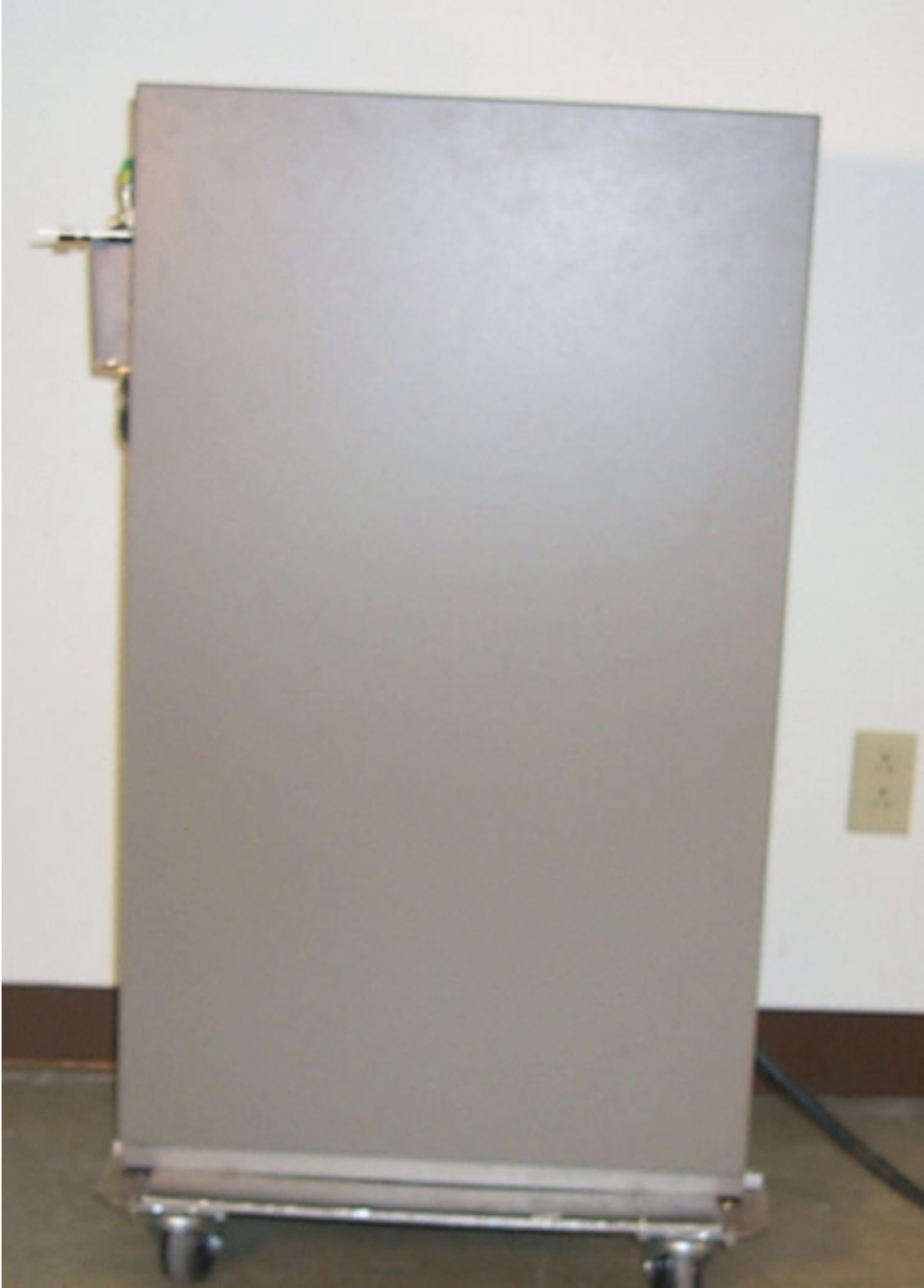
Backside view with cover on, Transmitter, Model: GL-T8600-CN