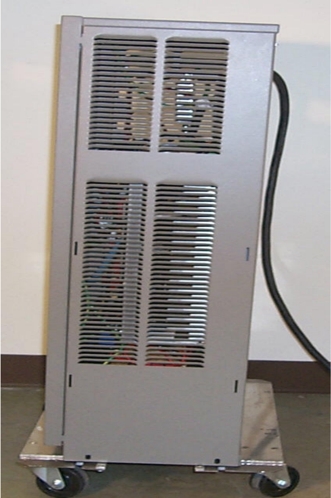
Left hand side view of transmitter, Model: GL-T8600-CN