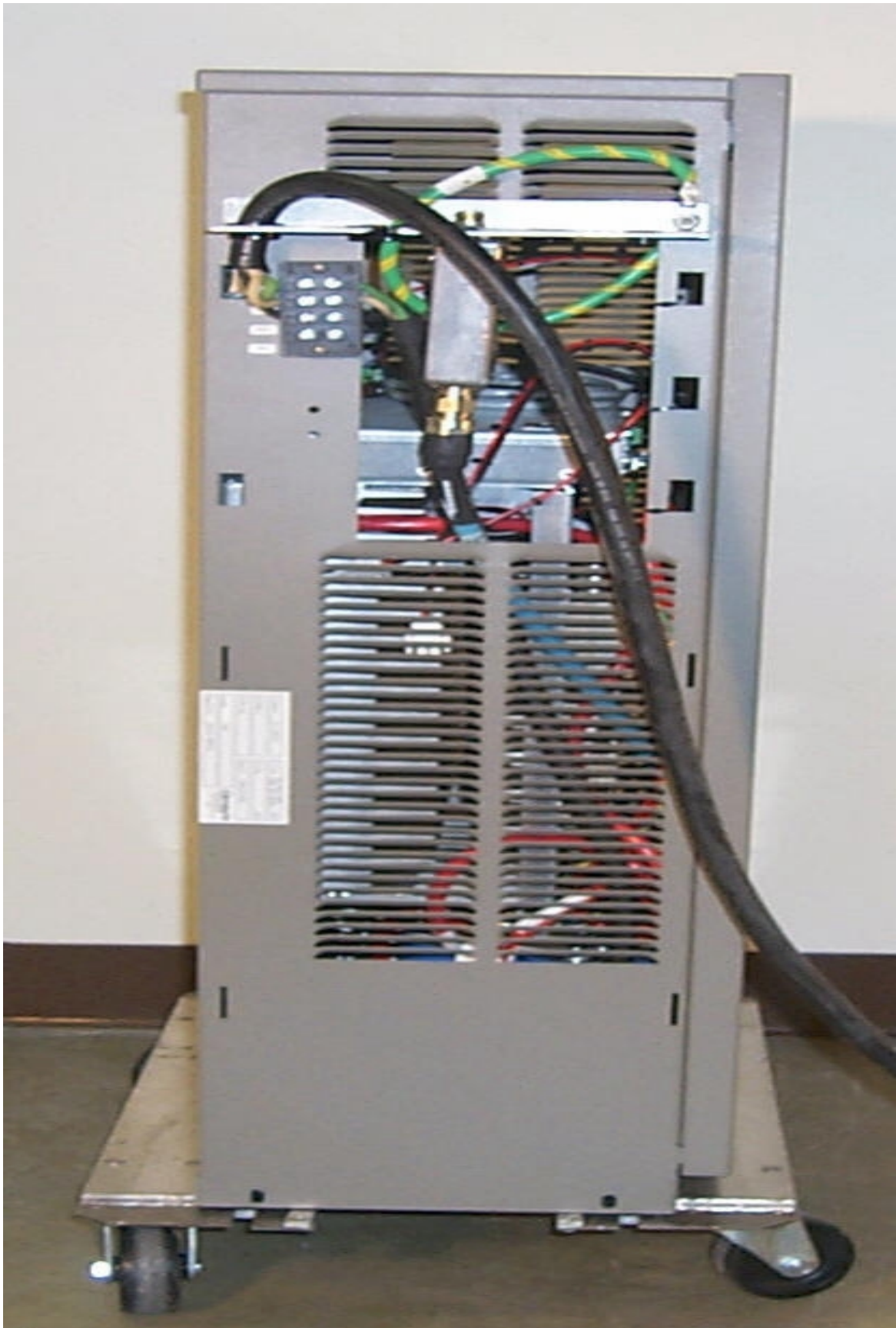
Right handside view of transmitter, Model: GL-T8600-CN