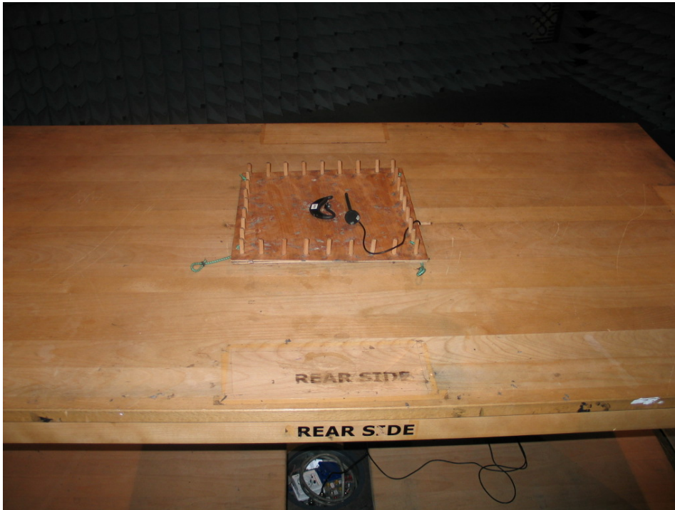
Photo 1: Test setup for radiated measurements (Enclosure, 30 MHz to 1 GHz)