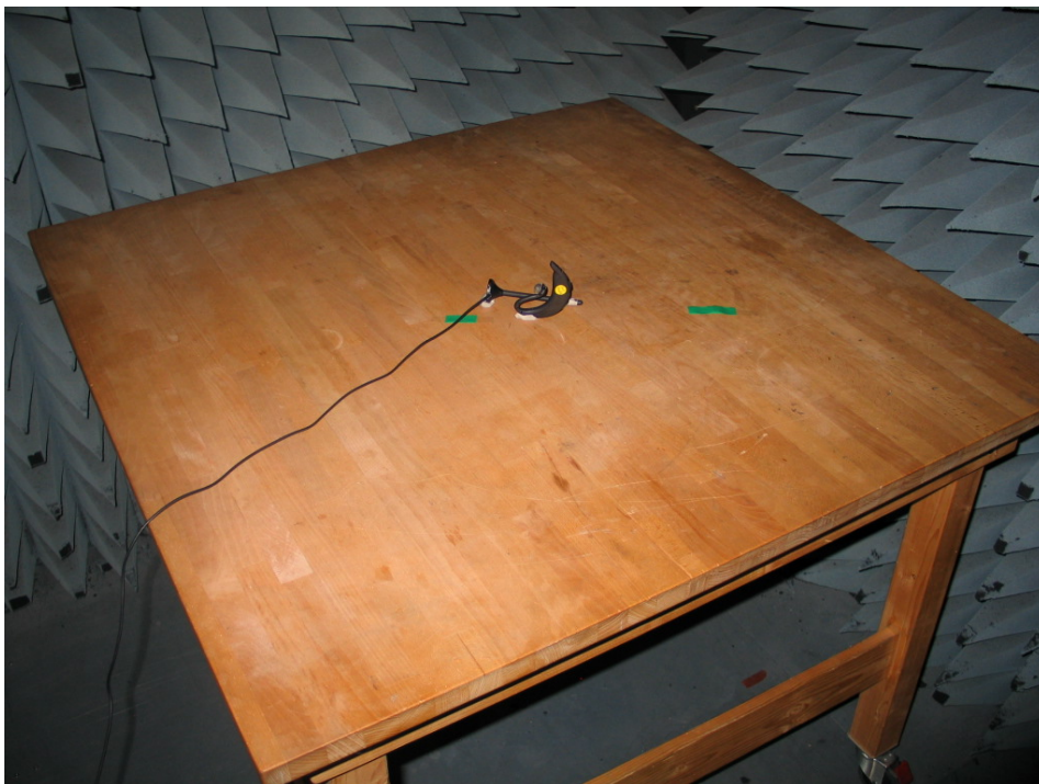
Photo 2: Test setup for radiated measurements (Enclosure, below 30 MHz)