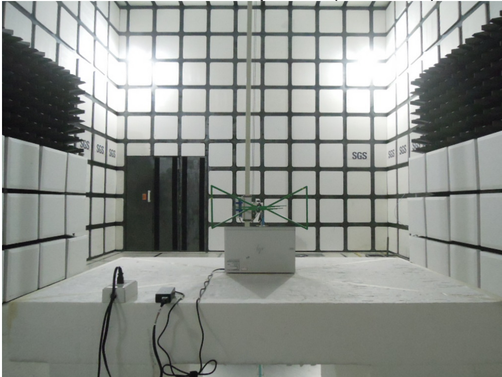
Radiated Emission Set up Photos (Above 1GHz)