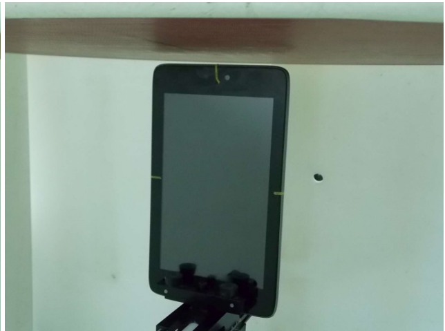
Edge 1 with Phantom 0.9 cm Gap