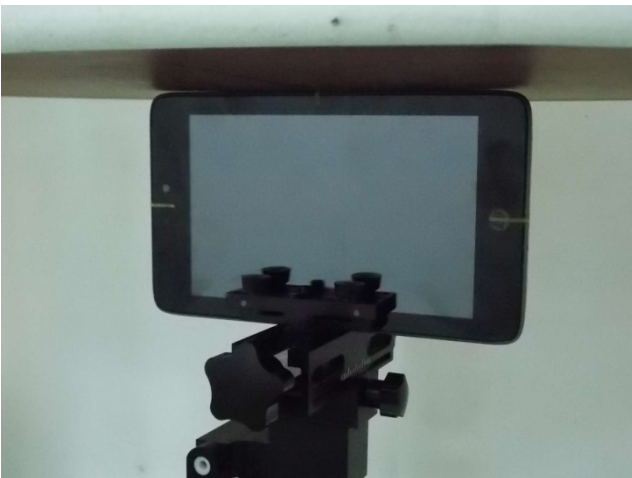
Edge 2 with Phantom 0 cm Gap