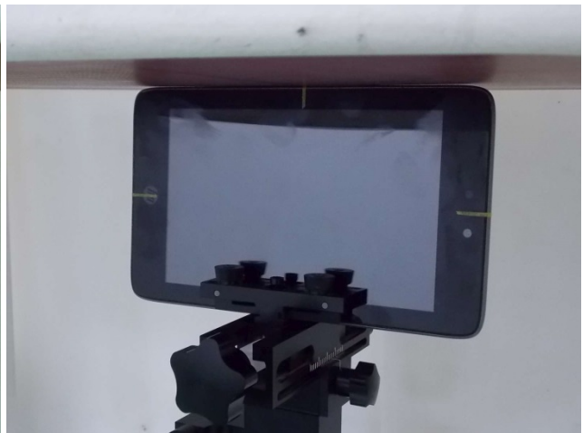
Edge 4 with Phantom 0 cm Gap