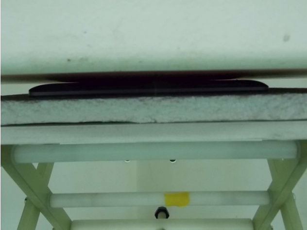
Bottom Face of Tablet with Phantom 0 cm Gap