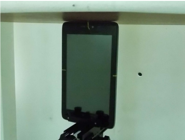
Edge 1 with Phantom 0 cm Gap