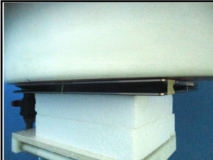
Body - Rear Face of EUT at 0 mm