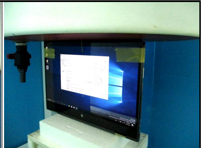
Body - Top Side of EUT at 0 mm