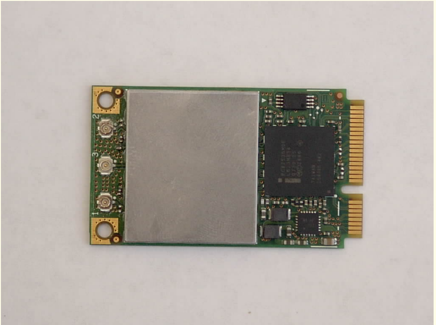
Top View “Insulation removed”