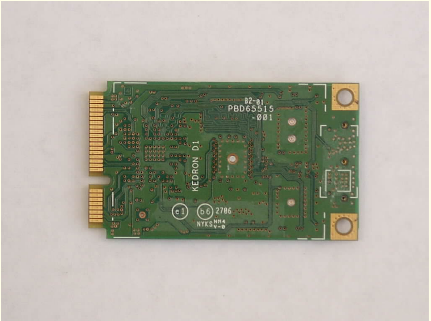
Bottom View “Insulation removed”