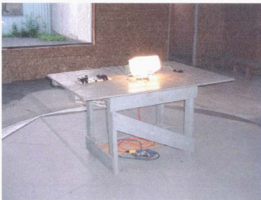
Photograph 2: Radiated Emissions

This report shall not be reproduced, except in full, without the written approval of DTT, Inc.