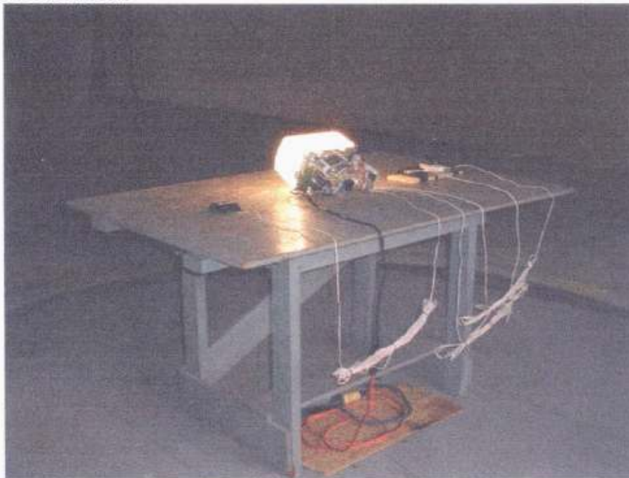
Photograph 1: Radiated Emissions