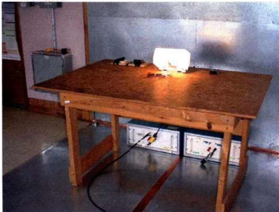
Photograph 1: Conducted Emissions