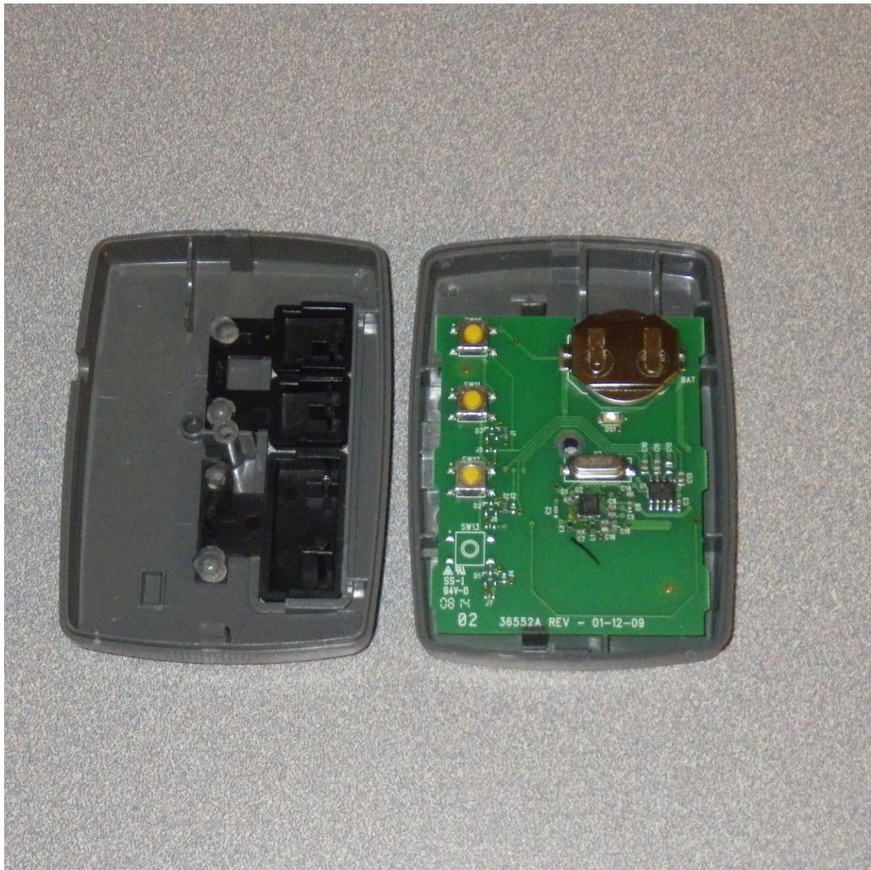
Figure 3: OCDFX3 Internal View / PCB Top