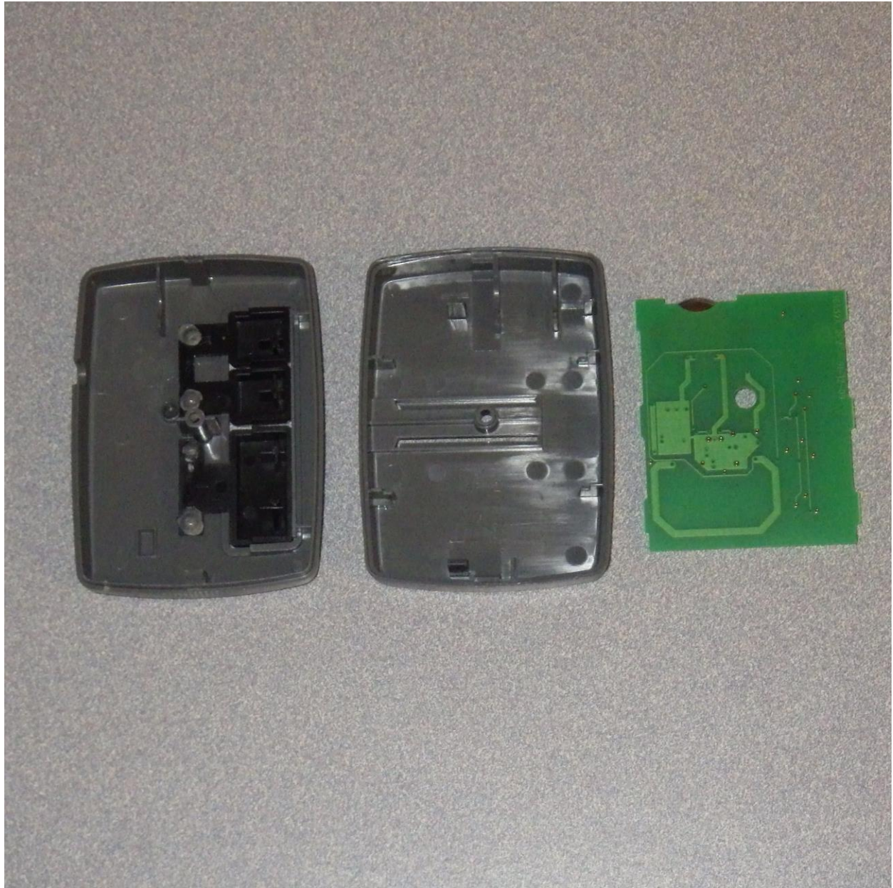
Figure 4: OCDFX3 Internal View / PCB Bottom