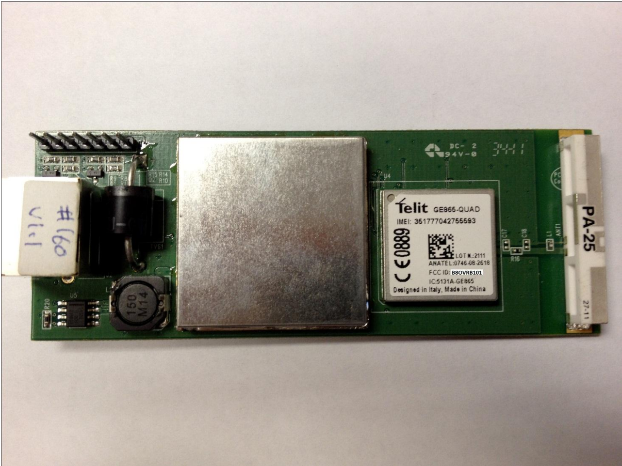
Circuit Board Top