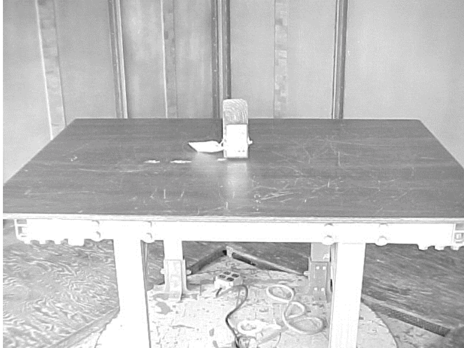
Test Setup Photograph