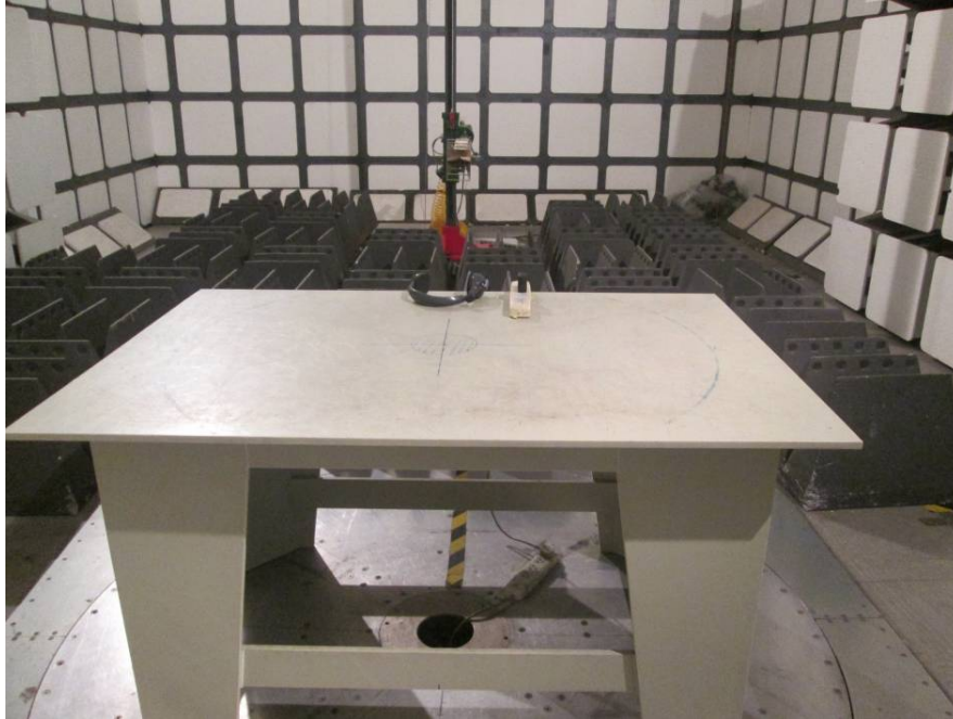
Radiated Emissions – Rear View (1-25 GHz)