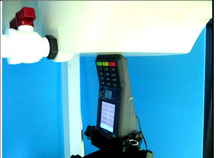
Bottom Side of EUT with 0 cm Gap