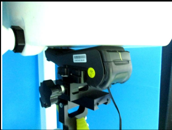
Front Face of EUT with 0 cm Gap