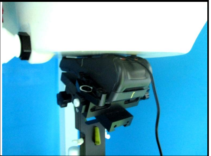
Rear Face of EUT with 0 cm Gap