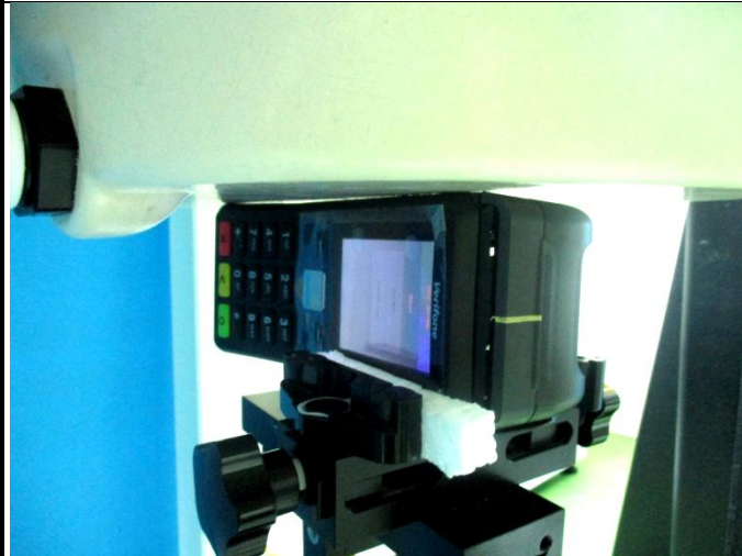
Left Side of EUT with 0 cm Gap