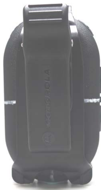
DUT Back View Swivel belt holster HKLN4438B