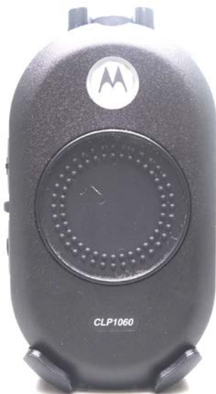
DUT Front View Swivel belt holster HKLN4438B