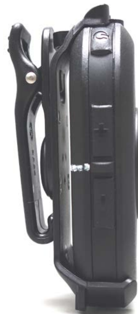
DUT Side View Swivel belt holster HKLN4438B