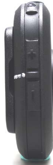
DUT Side View Magnetic case HKLN4433A