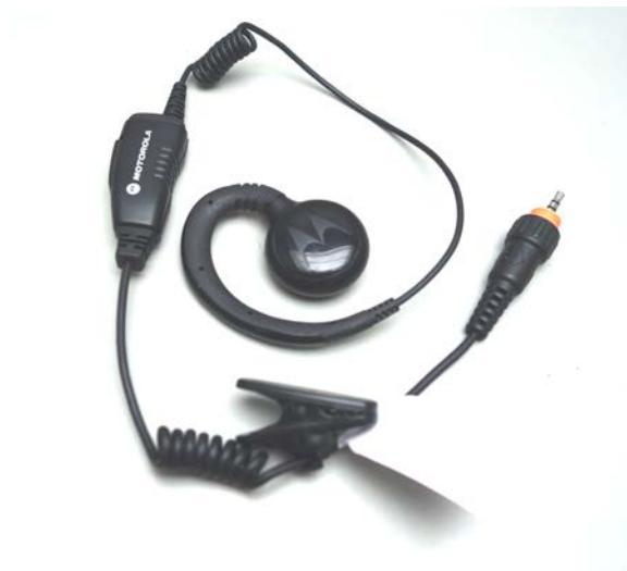
HKLN4529A Short cord earpiece