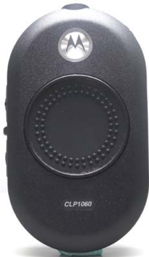
DUT Front View Magnetic case HKLN4433A