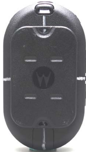
DUT Back View Magnetic case HKLN4433A