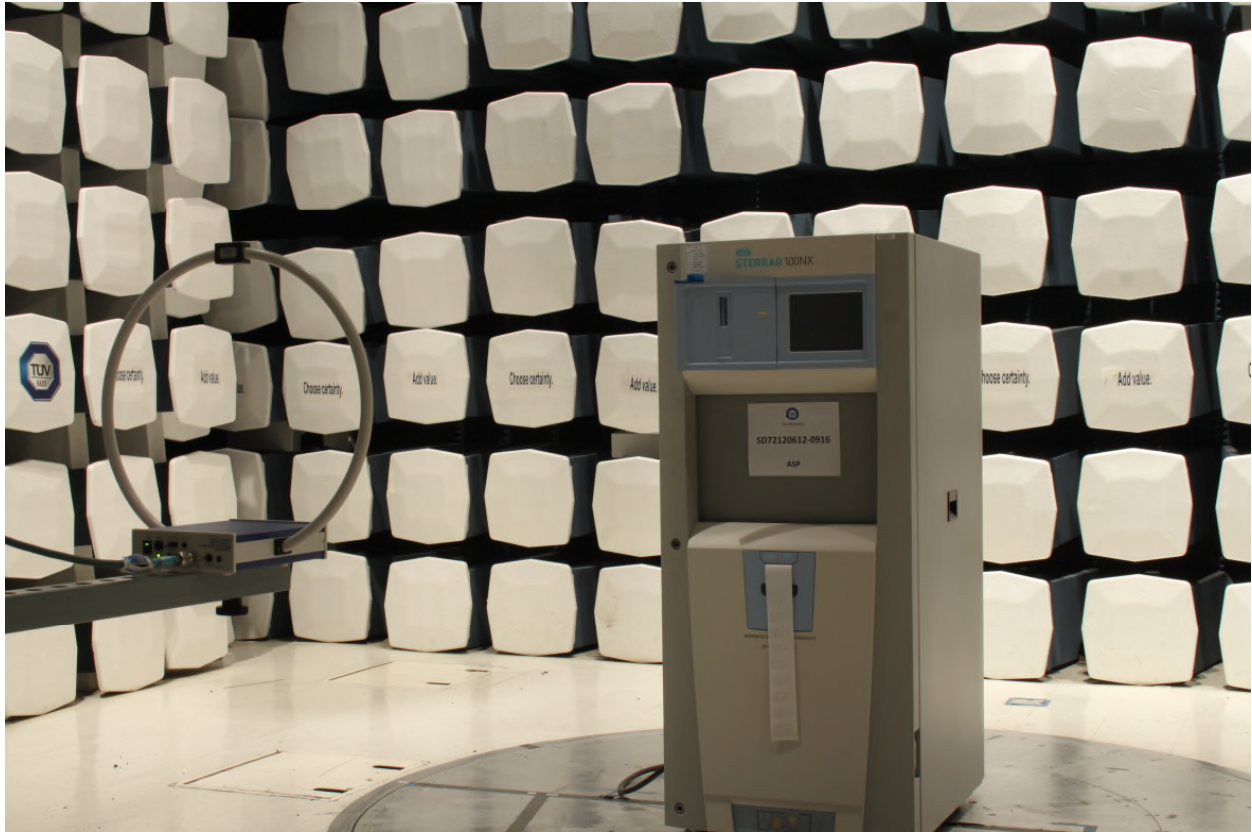
Radiated Emissions Test Setup (below 30 MHz)