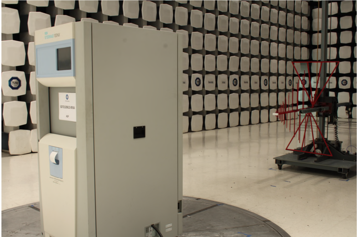
Radiated Emissions Test Setup (below 1GHz)