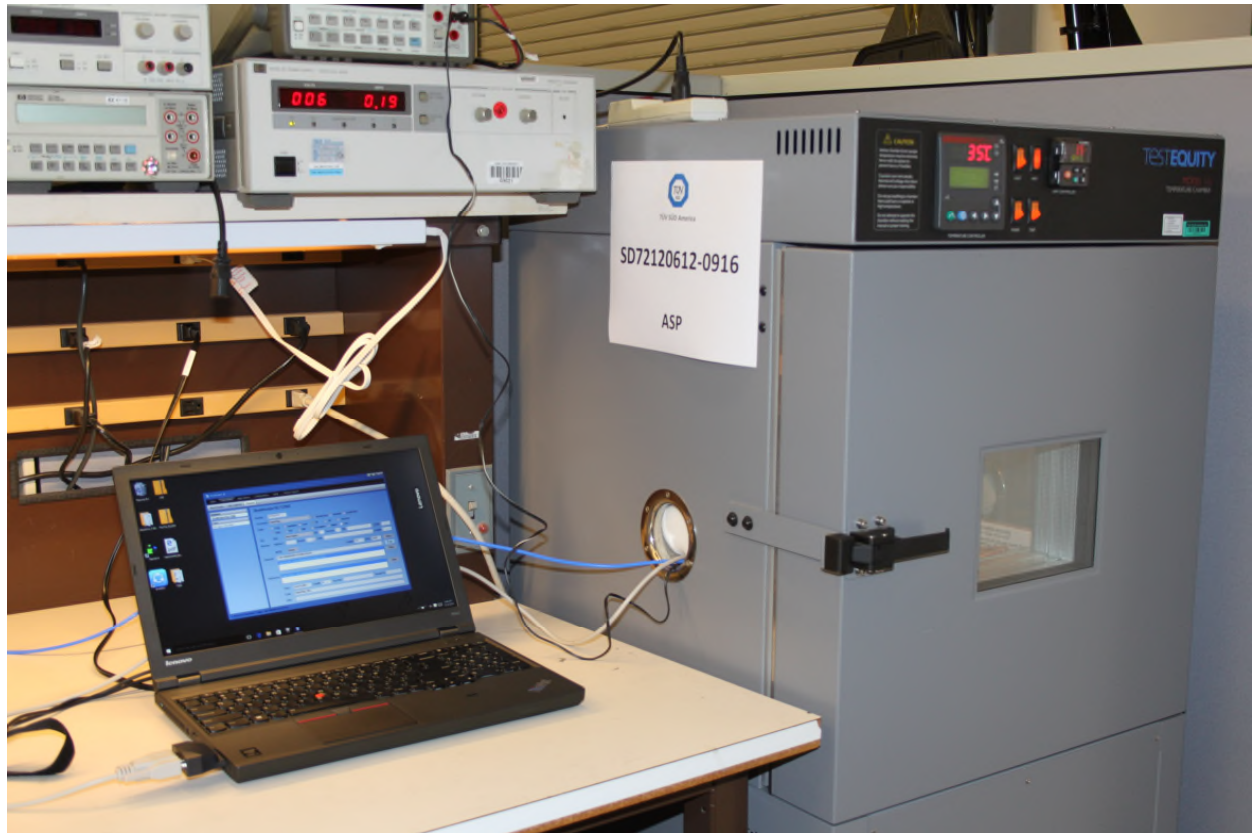
Frequency Stability Test Setup