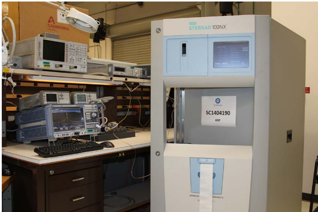
Antenna Conducted Port Test Setup