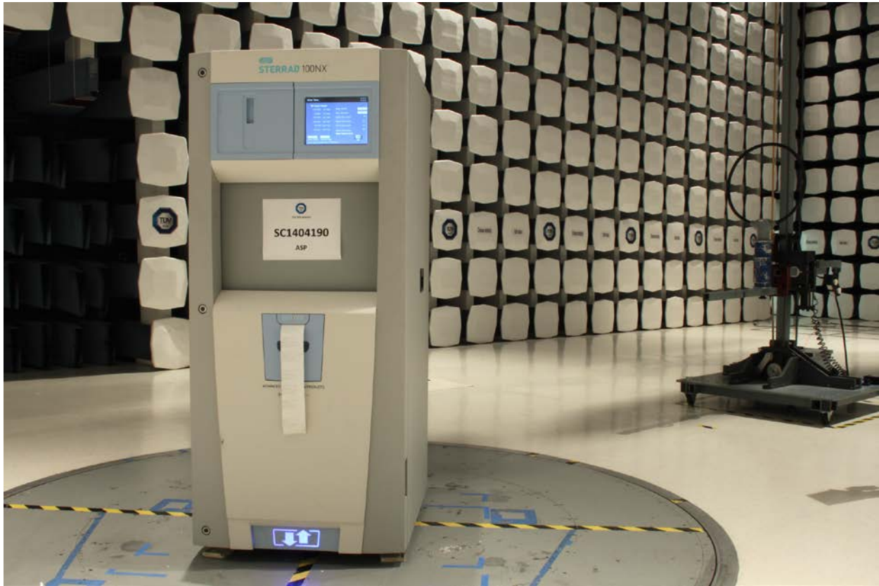
Radiated Emissions Test Setup (below 30MHz)