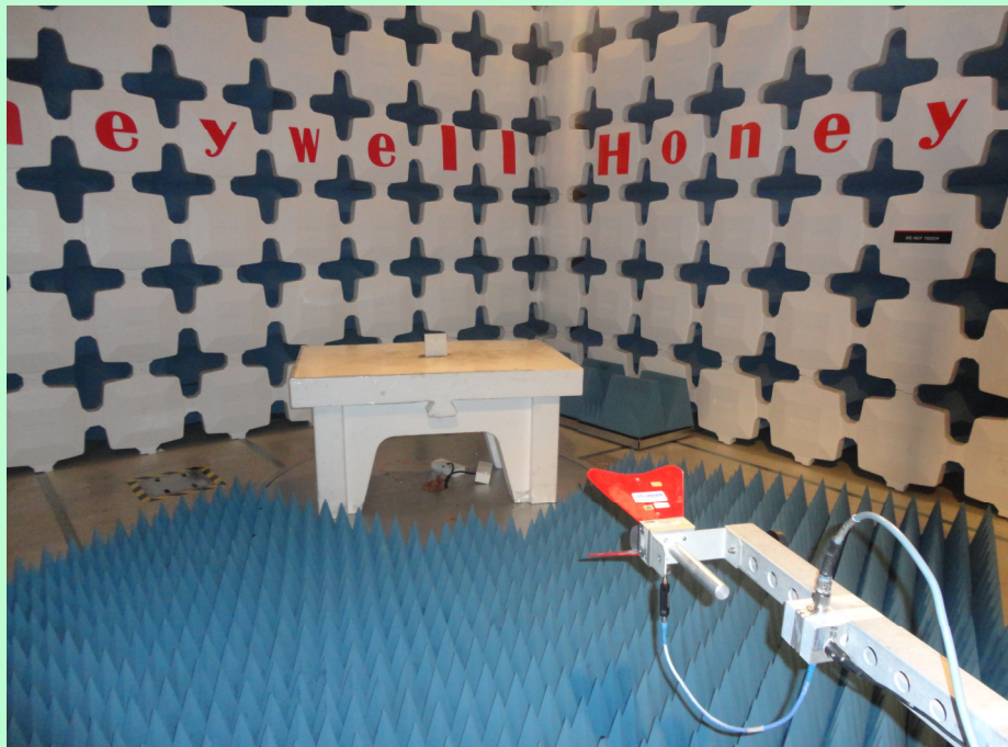
Radiated Emission Setup – 1GHz to 10 GHz [ Vertical Polarization ]