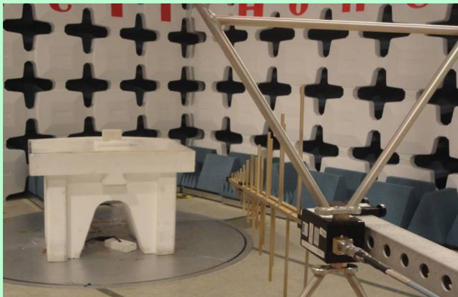
Radiated Emission Setup – 30MHz to 1GHz [ Vertical Polarization ]