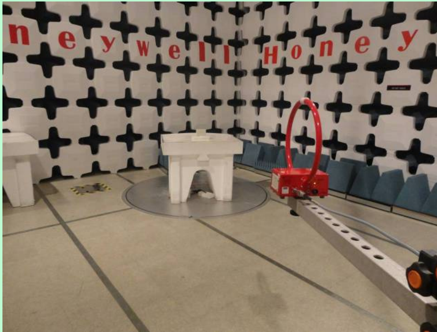
Radiated Emission Setup – 9KHz to 30MHz [Parallel]