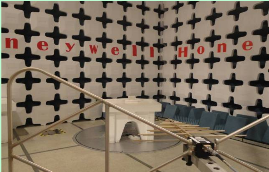
Radiated Emission Setup – 30MHz to 1GHz [ Horizontal Polarization ]