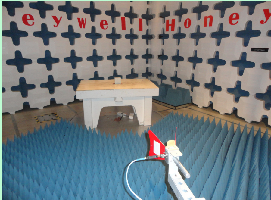
Radiated Emission Setup – 1GHz to 10GHz [Horizontal Polarization]