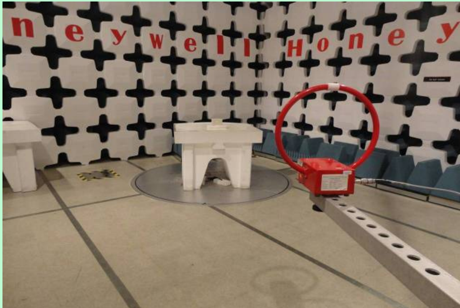
Radiated Emission Setup –9KHz to 30MHz [ Perpendicular ]